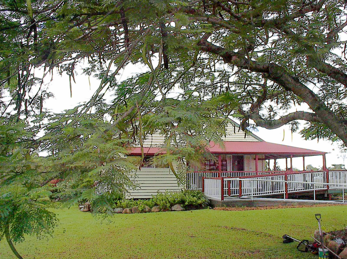
Marian, Haus der Sängerin Melba (1861 bis 1931)