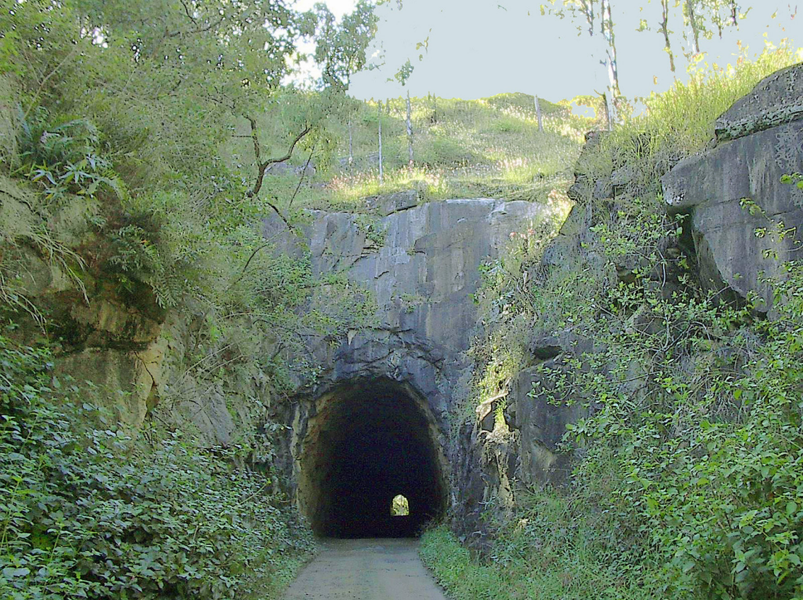
Boolbonda-Tunnel, 1883 nur mit Picke und Meißel gebaut