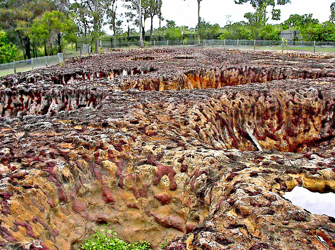
'Mystery Craters' bei Bundaberg