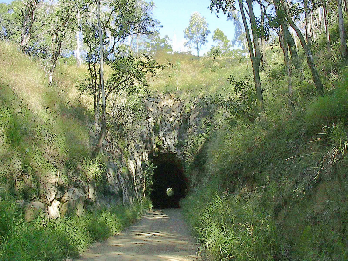
Boolbonda-Tunnel, 1883 nur mit Picke und Meißel gebaut