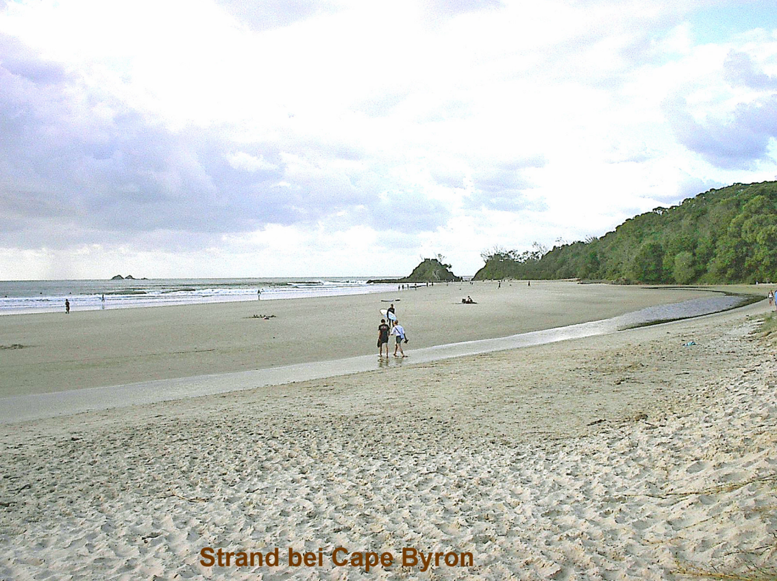
Strand bei Cape Byron