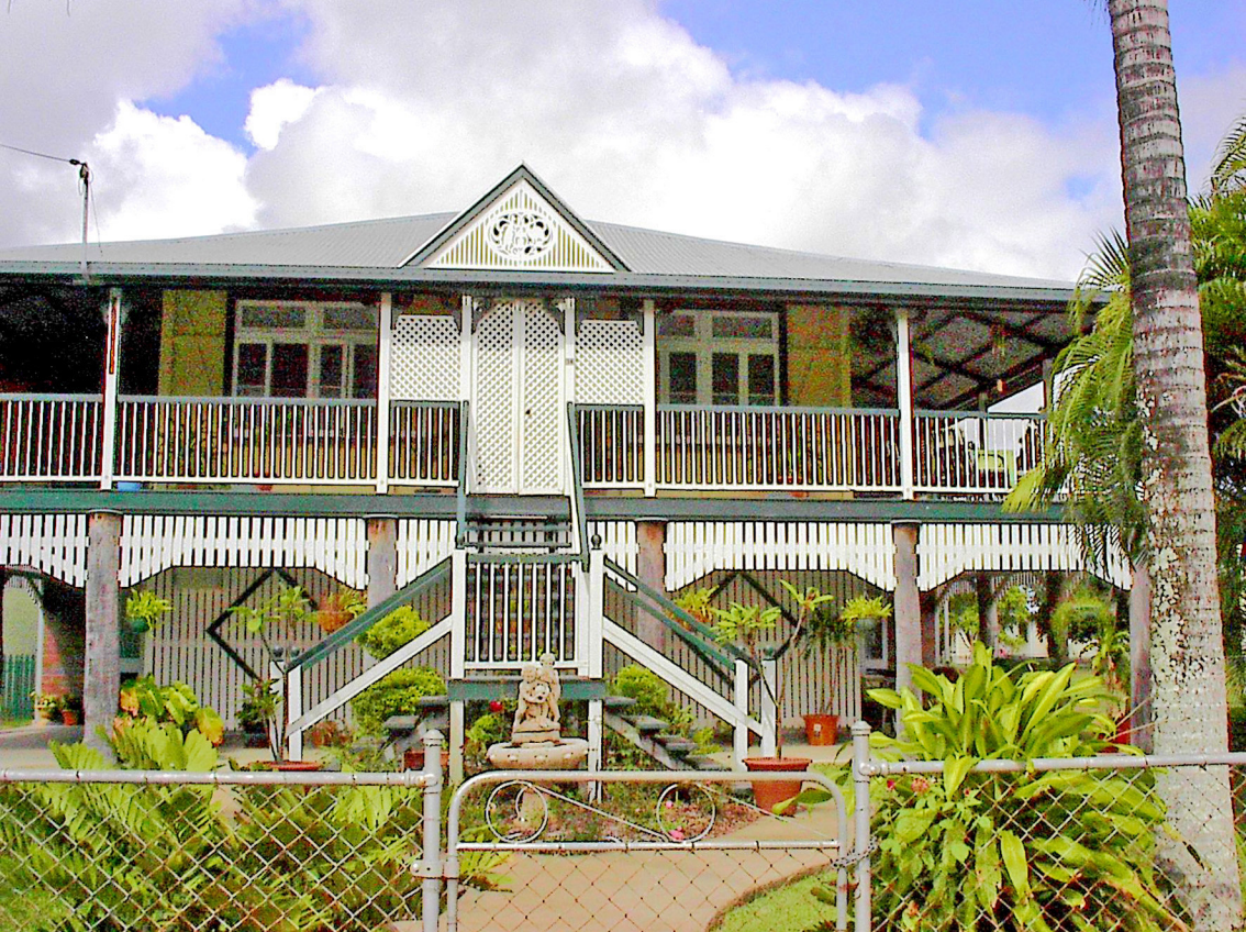
Marian, typisches Queensland-Haus