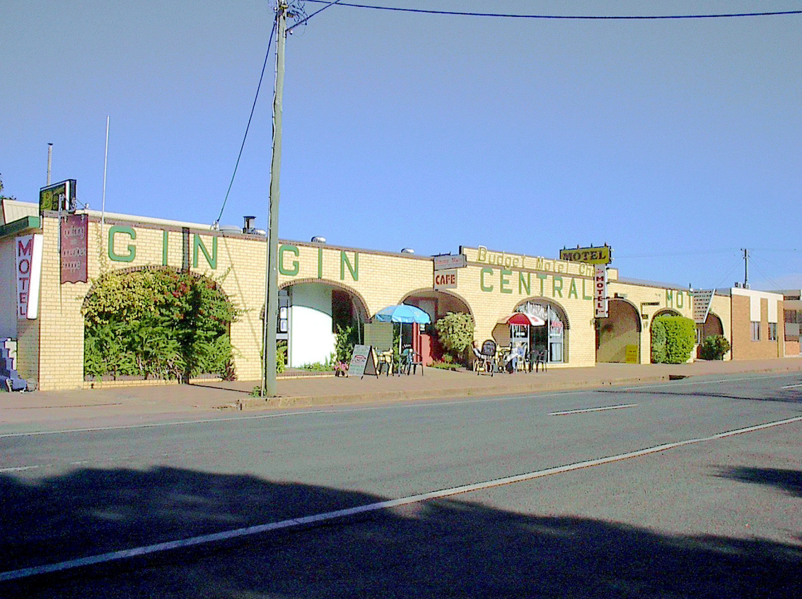
Motel in Gin Gin