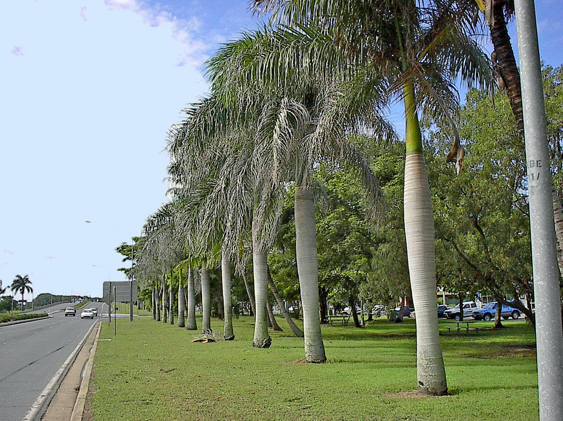
Palmen-Allee bei Mackay