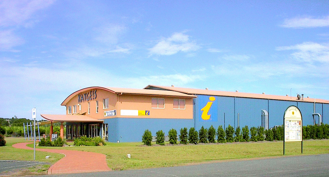
'Kaygees' Nussfabrik in Hervey Bay