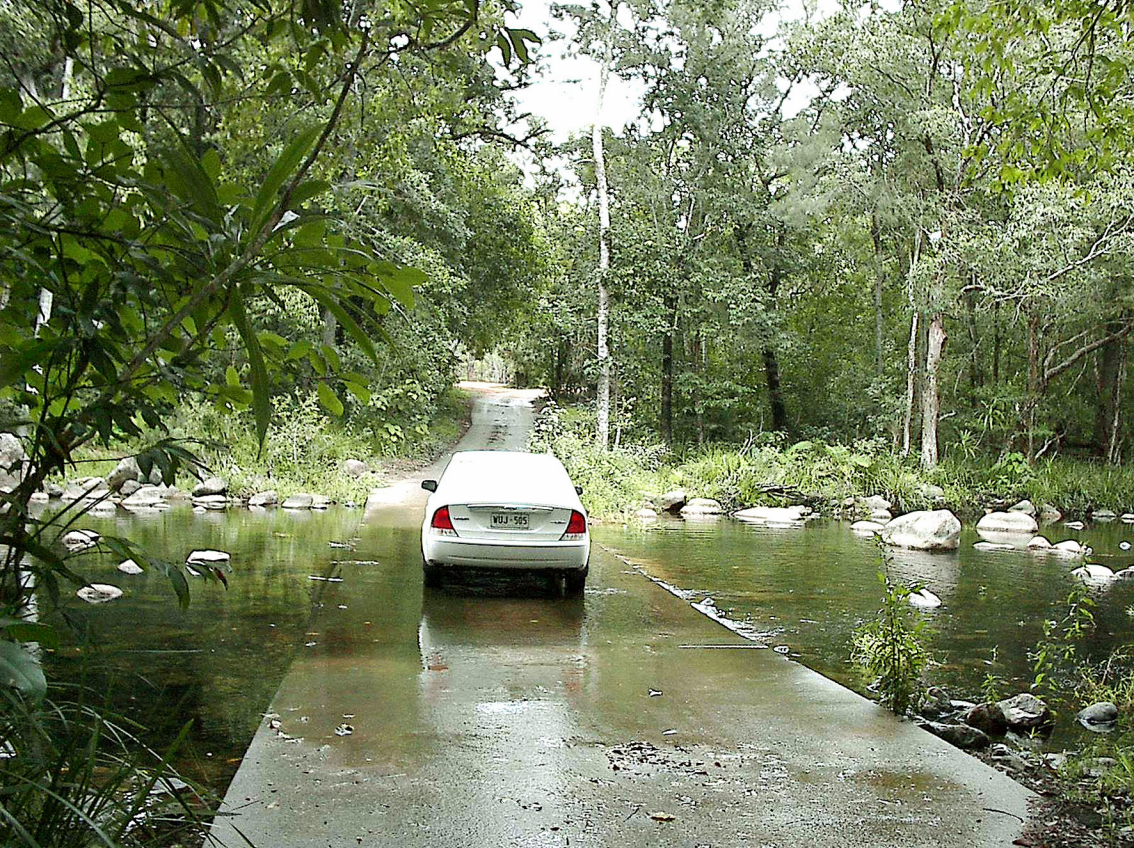
Weg zu den Jourama Falls