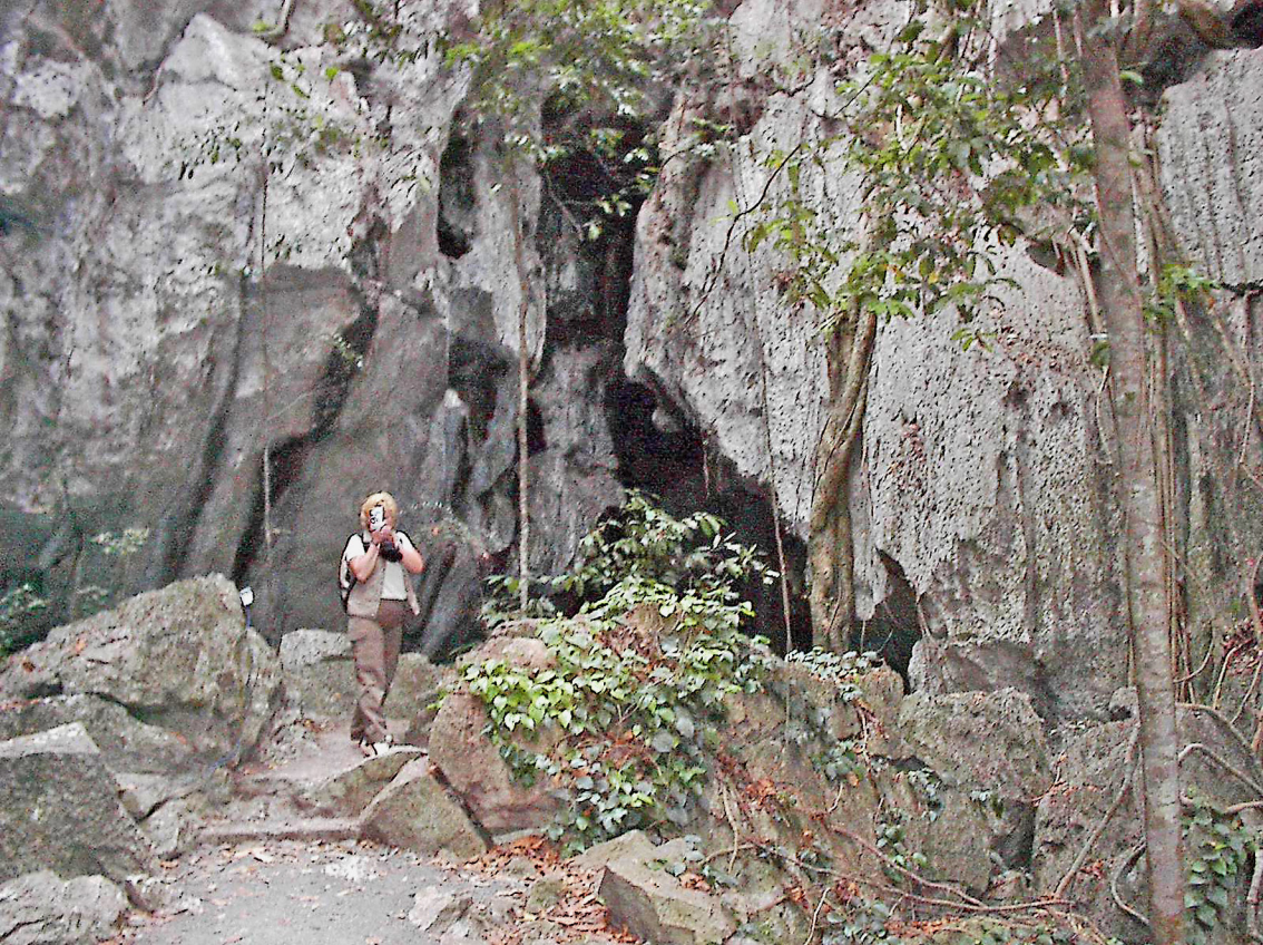
Cathedral Cave, Eingang