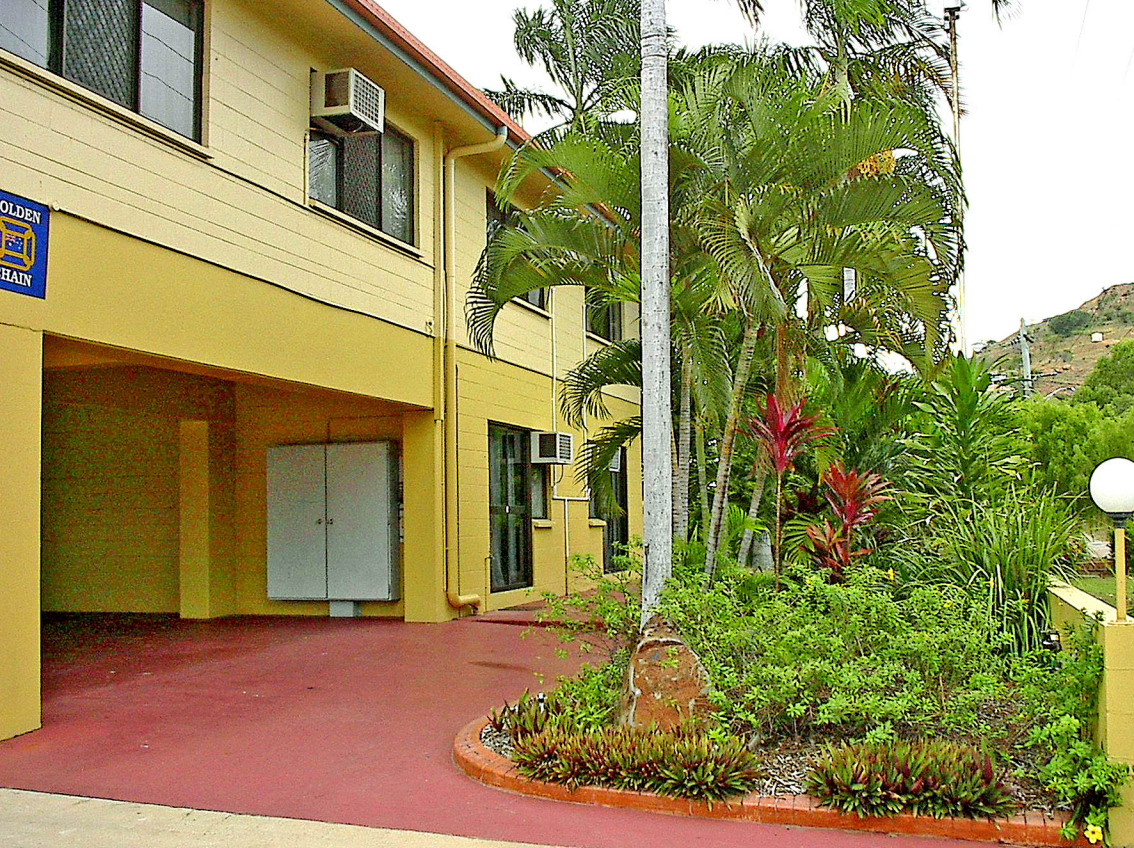
Townsville Summit Motel