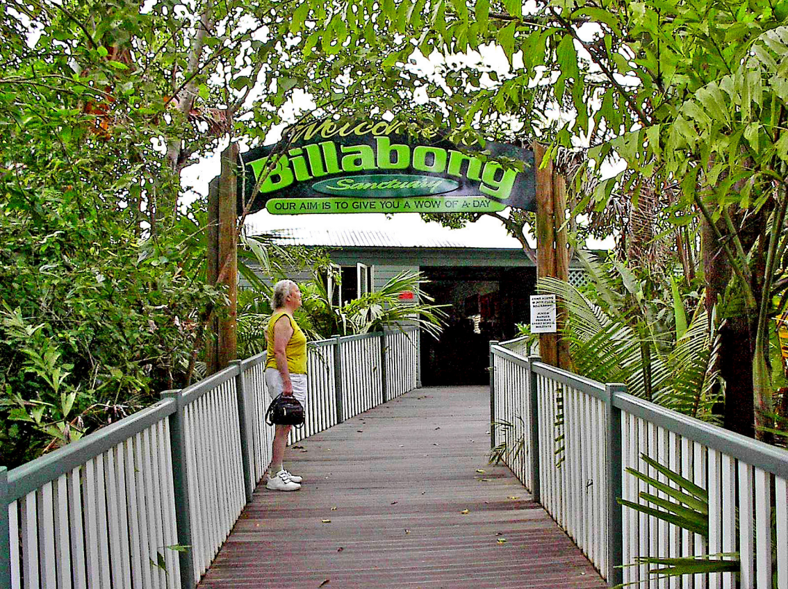
Billabong Sanctuary Wildlife Park bei Townsville