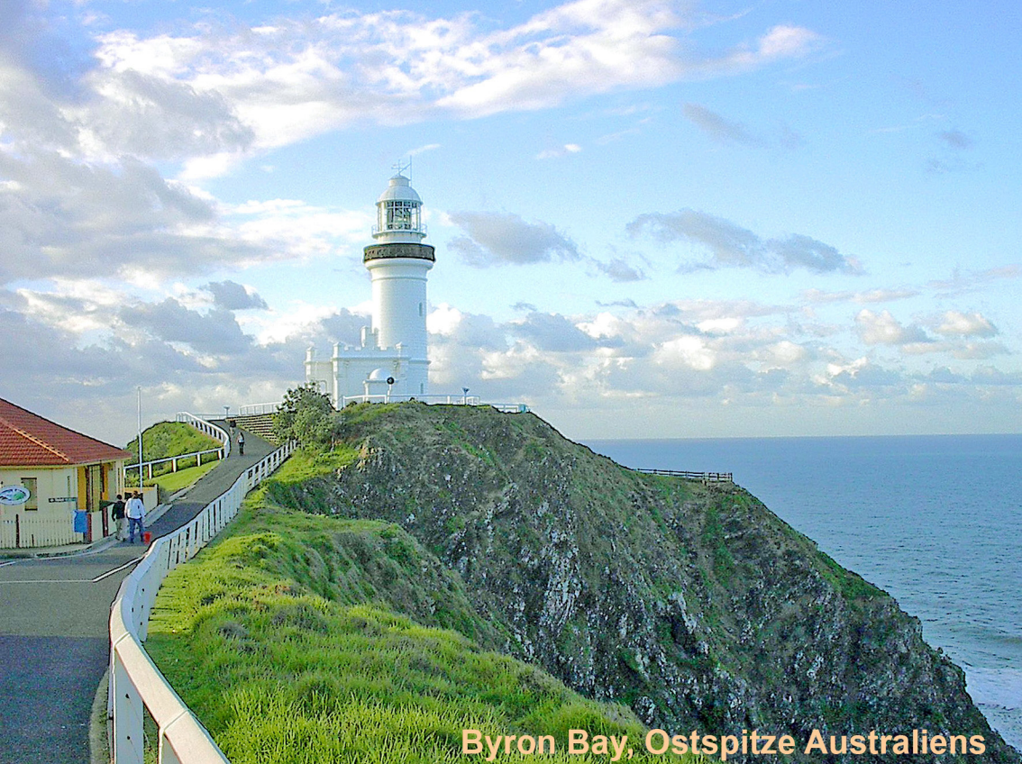
Byron Bay, Ostspitze Australiens