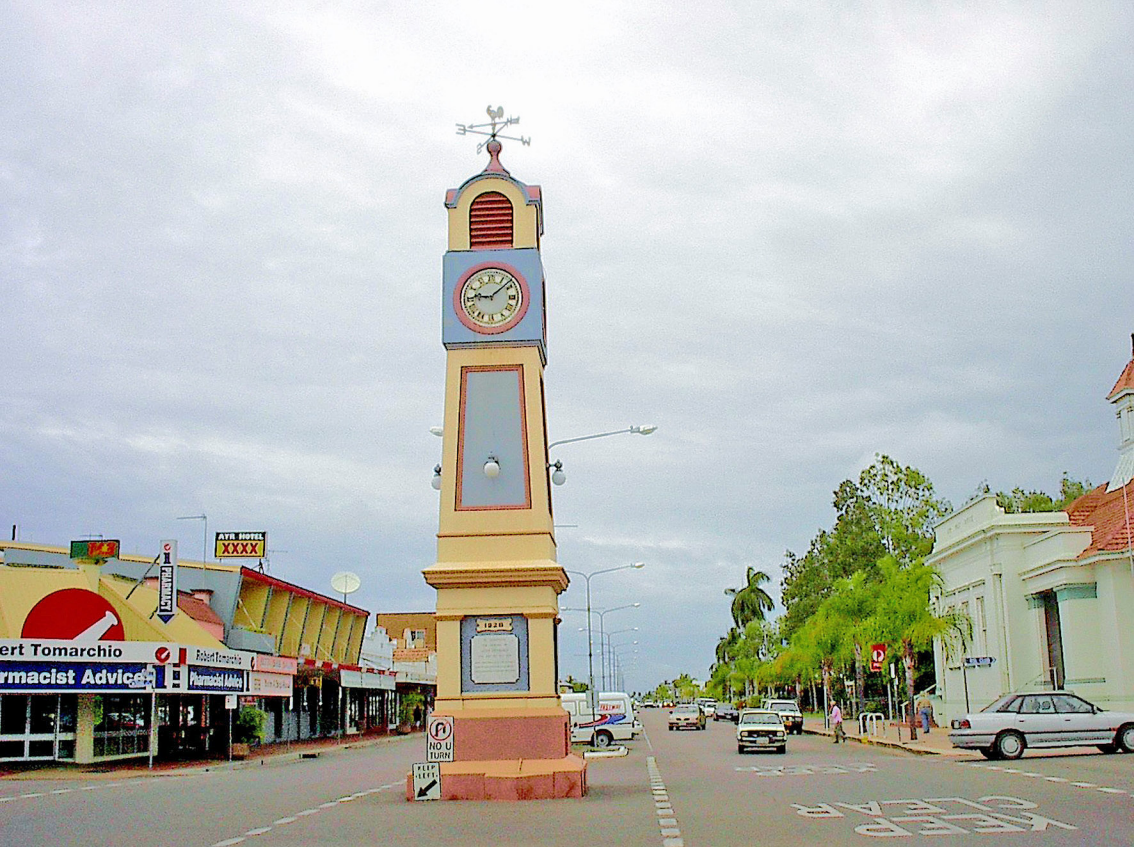
Ayr und die Uhr