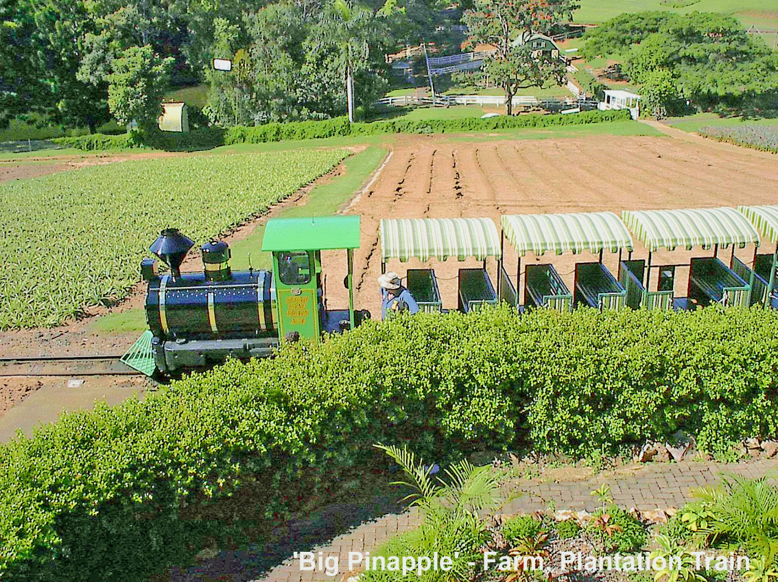
'Big Pineapple' - Farm Plantation Train