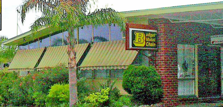
Motel in Nowra