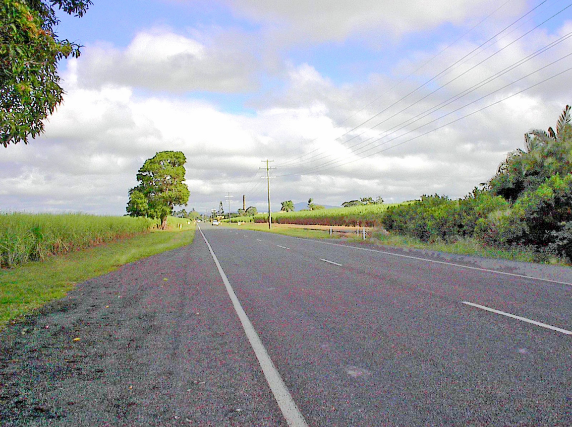
Straße zum Pioneer Valley