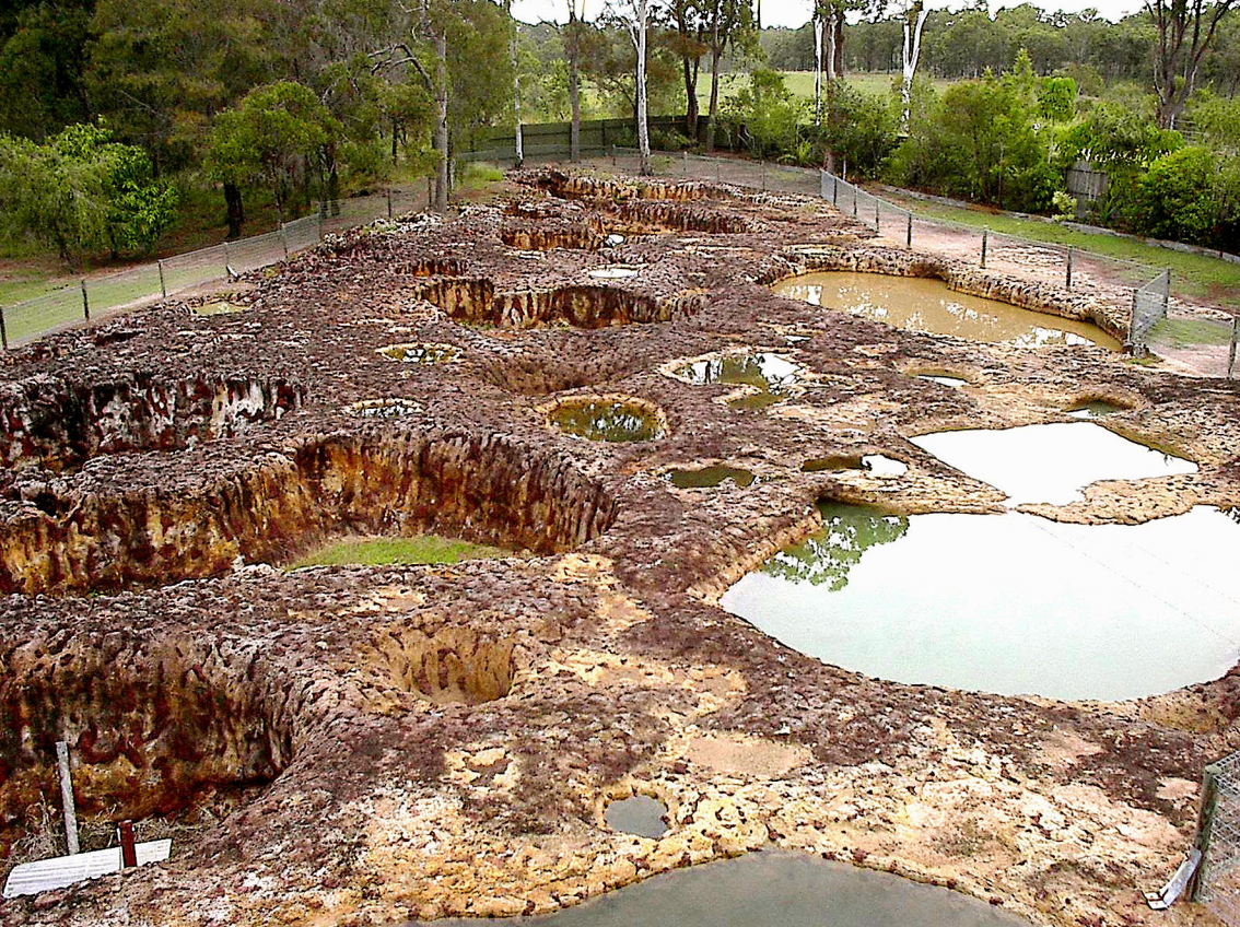
'Mystery Craters' bei Bundaberg