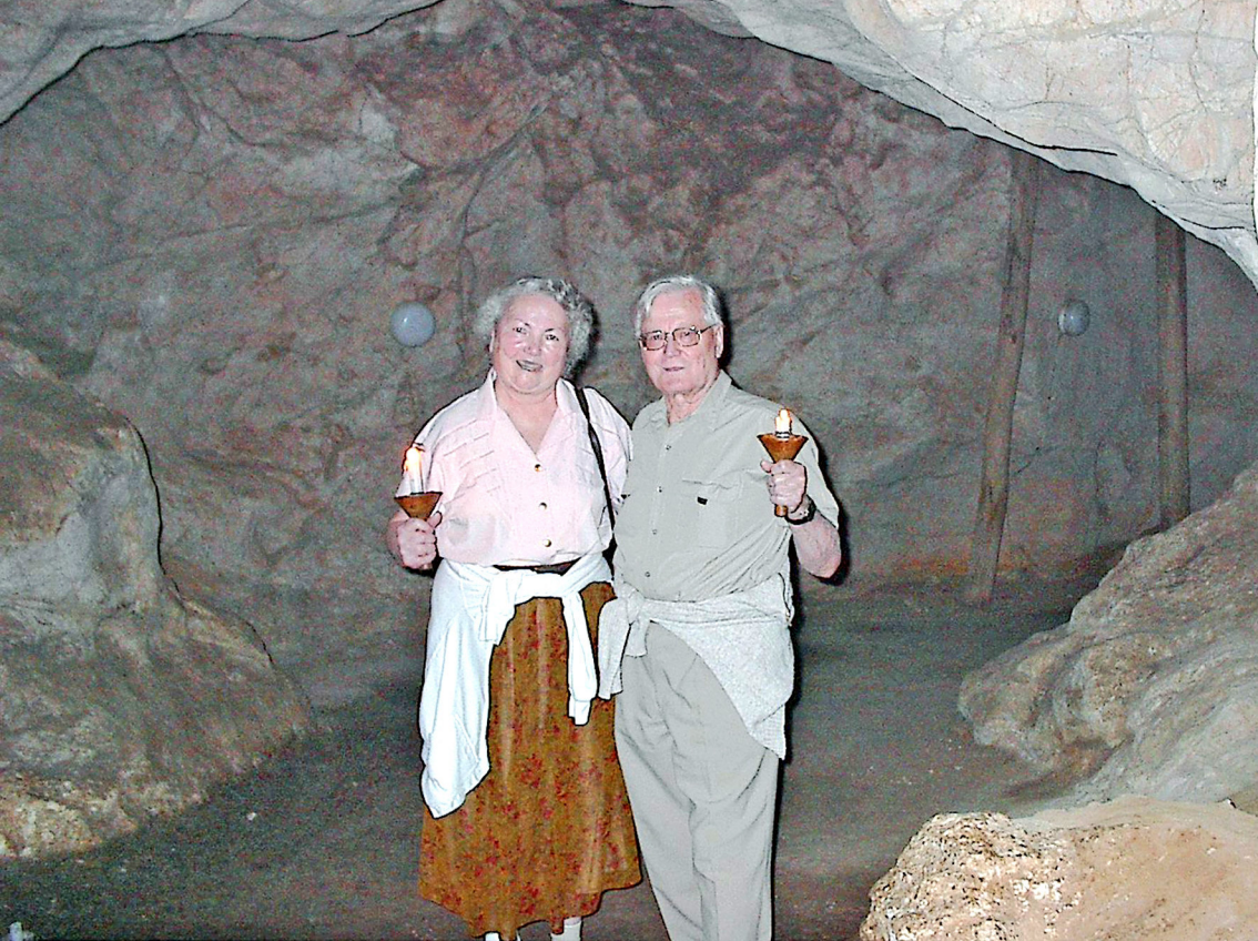
Capricorn Caves, Abenteuer-Tour in der Cathedral Cave