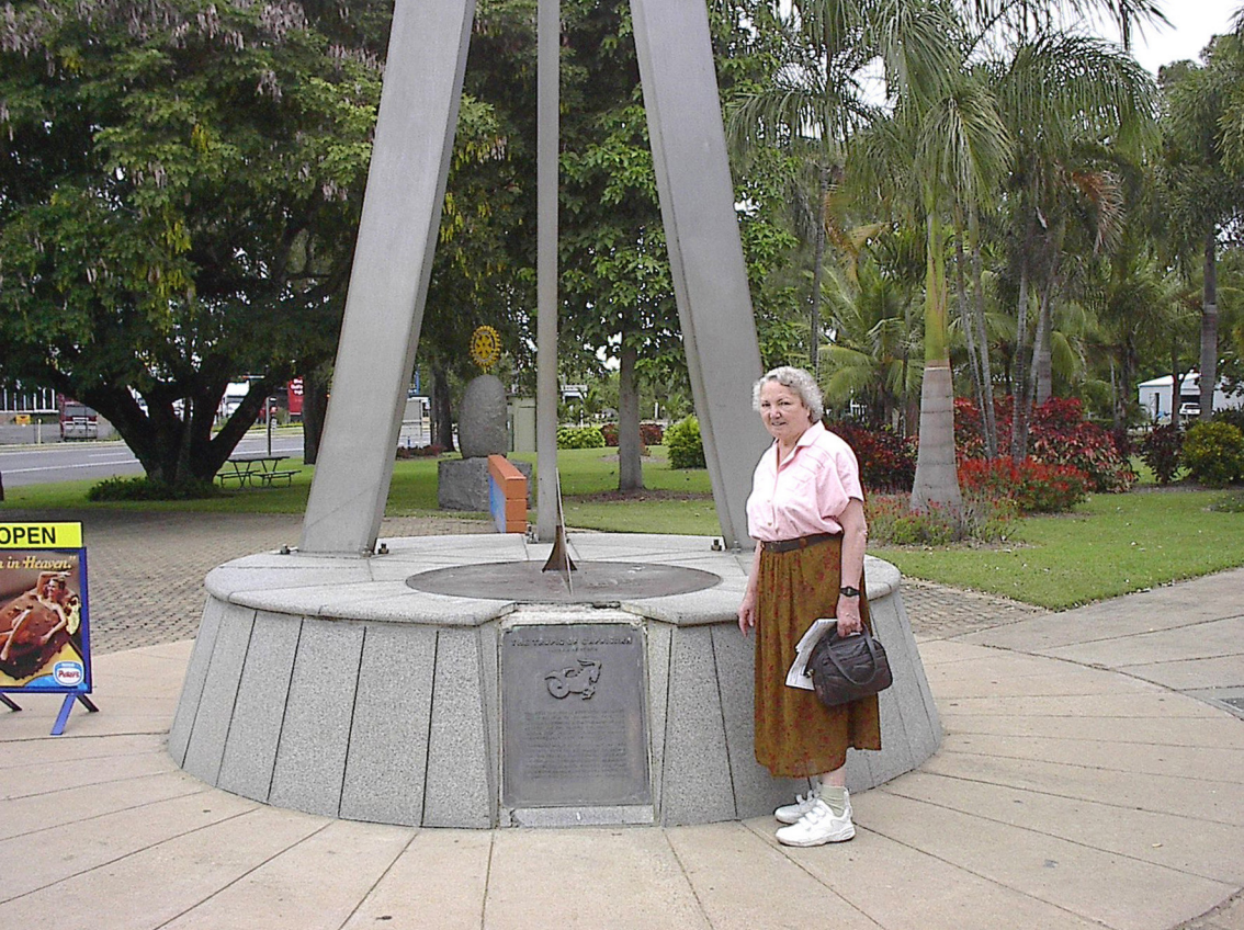
Rockhampton, Tropic of Capricorn (23°26'30" Süd).