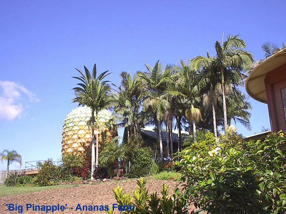
'Big Pineapple' - Ananas Farm