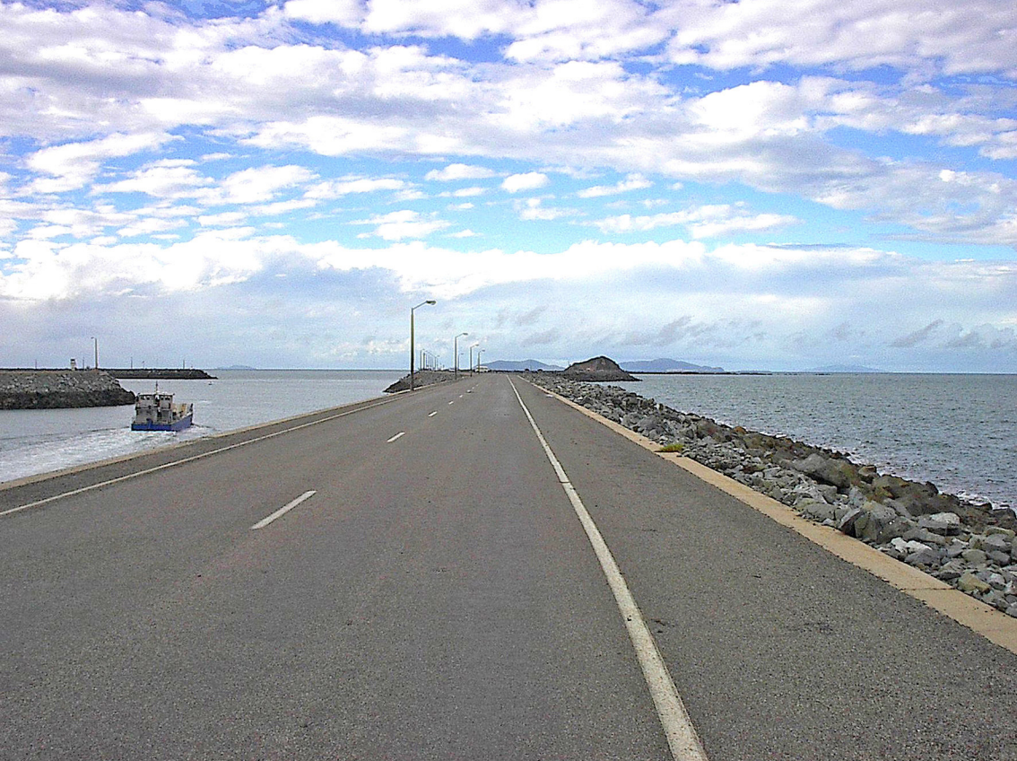
Mackay, 1,8km lange Mole