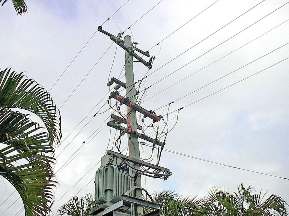
Townsville Summit Motel und die Elektroinstallation davor