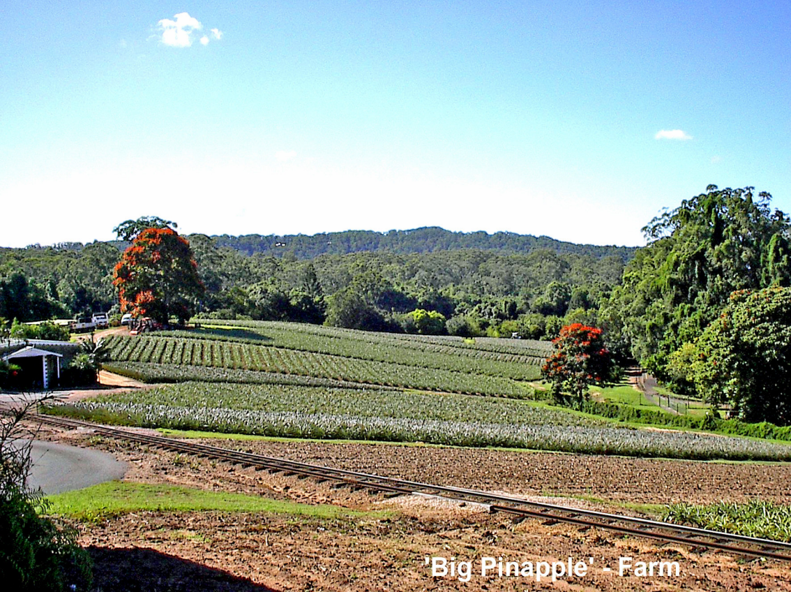
'Big Pinapple' - Farm