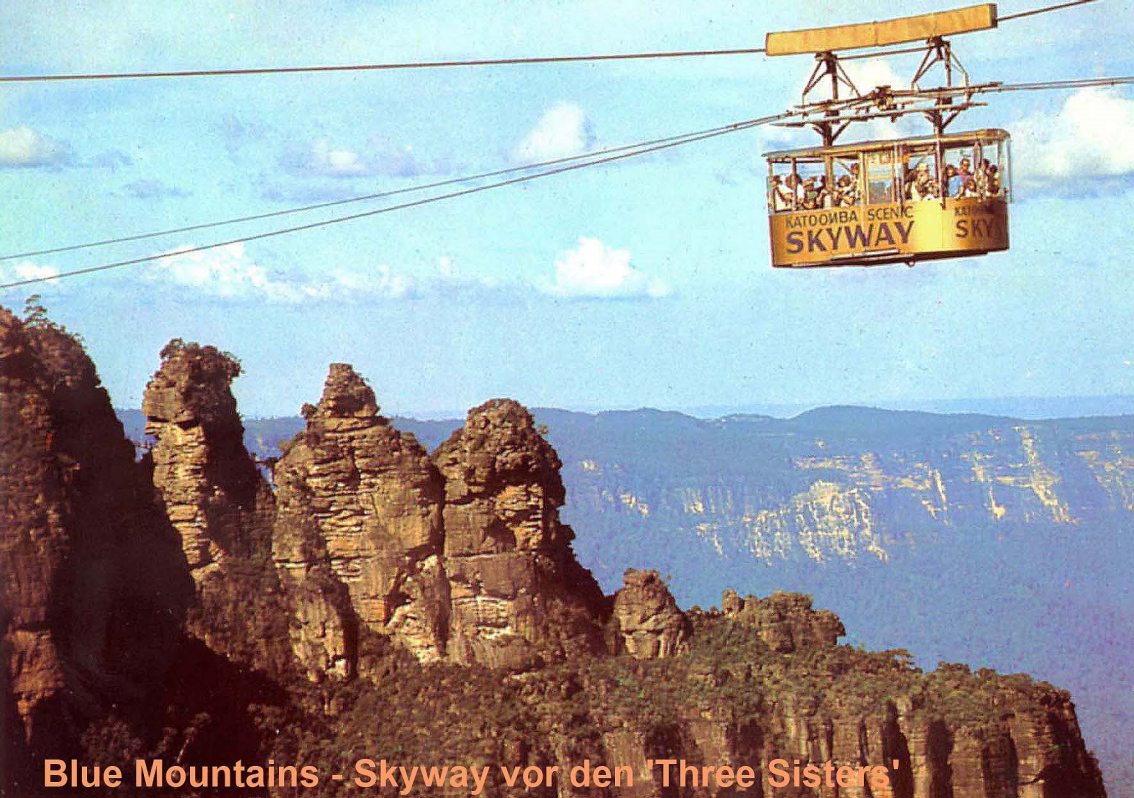
Blue Mountains - Skyway vor den 'Three Sisters'