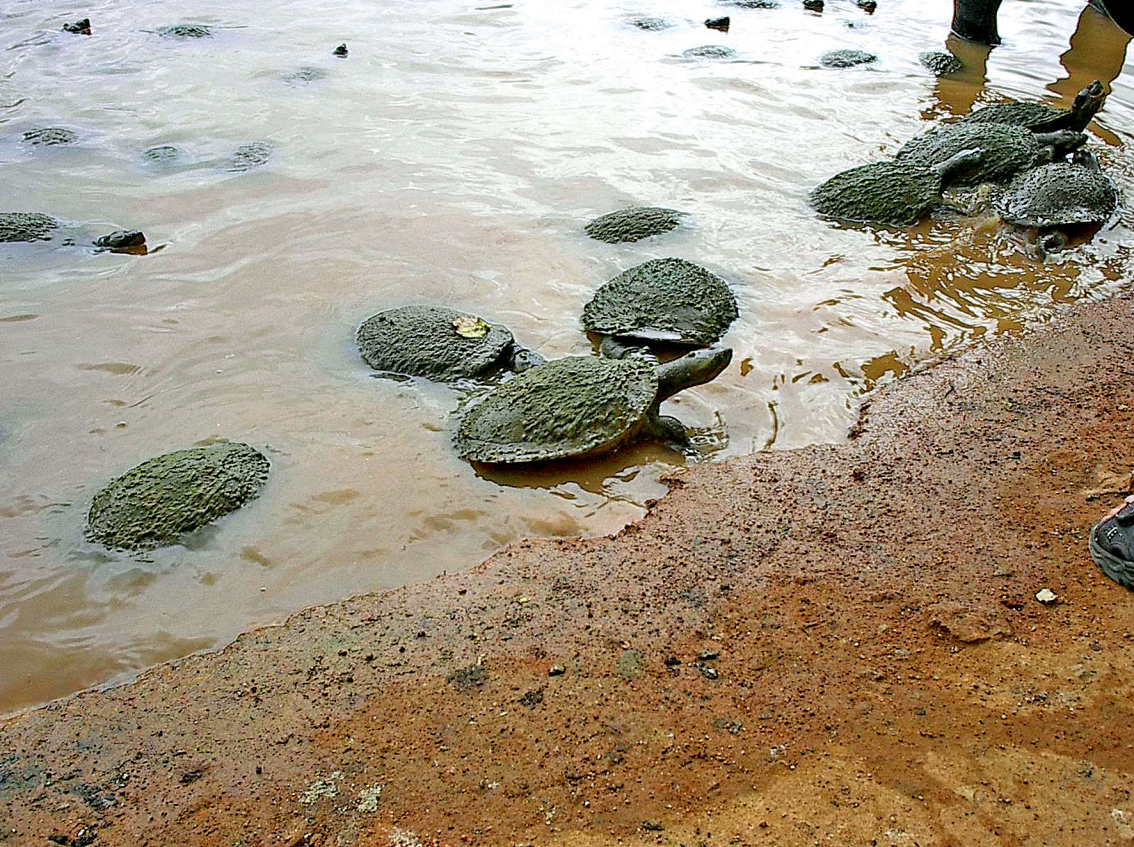
Billabong Wildlife Park, Schildkröten-Fütterung