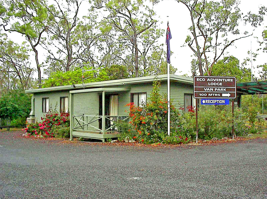
Capricorn Caves, Lodge