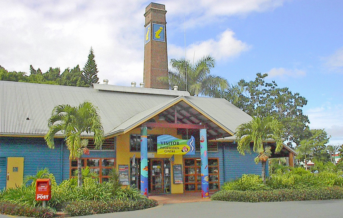
Visitor-Center in Mackay