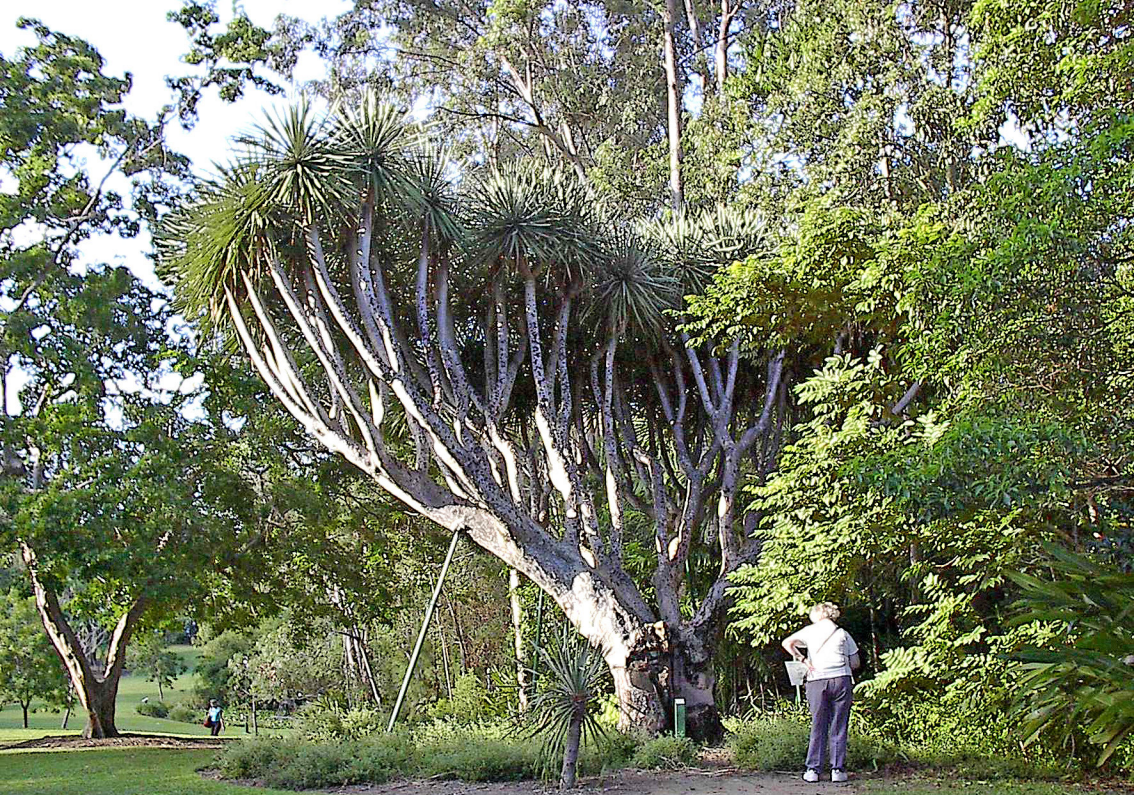
Brisbane - Botanischer Garten