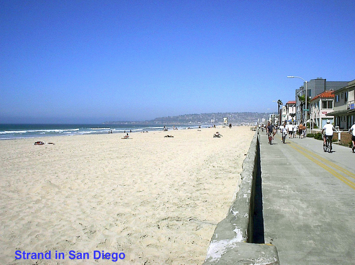
Strand in San Diego