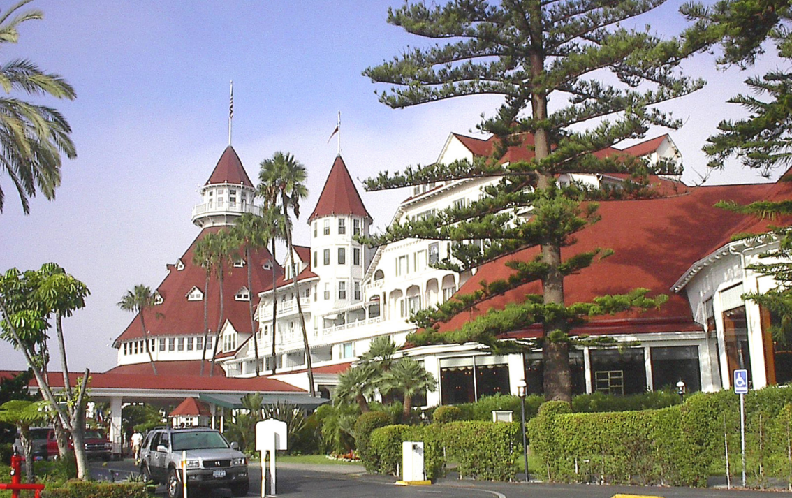
San Diego - Hotel Del Coronado