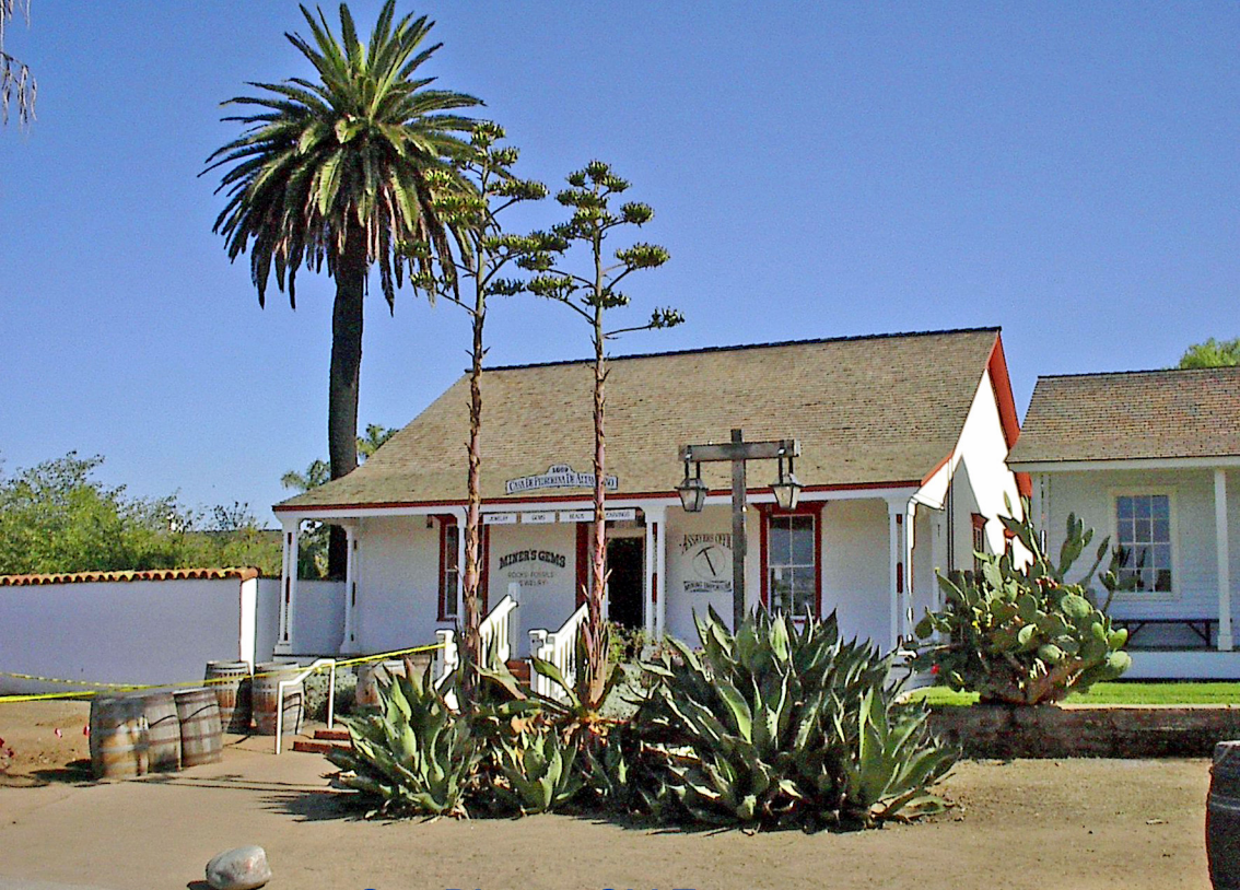
San Diego - Old Town