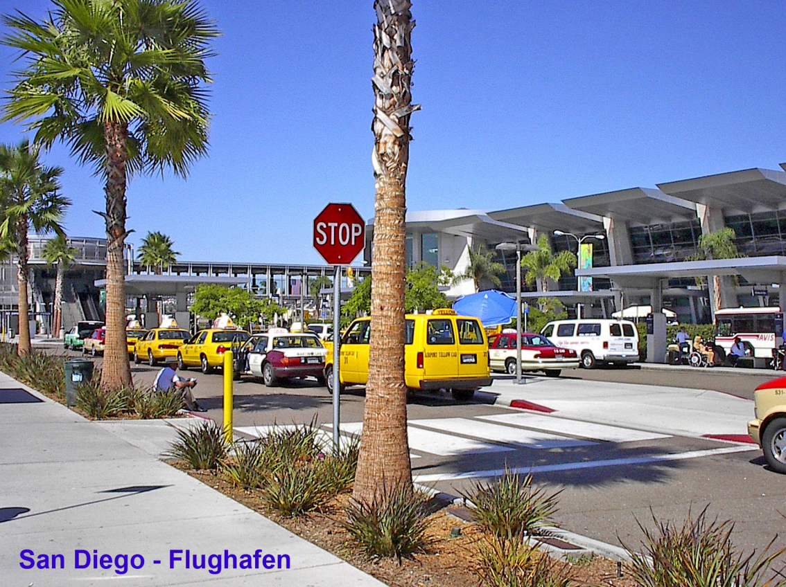
San Diego - Flughafen