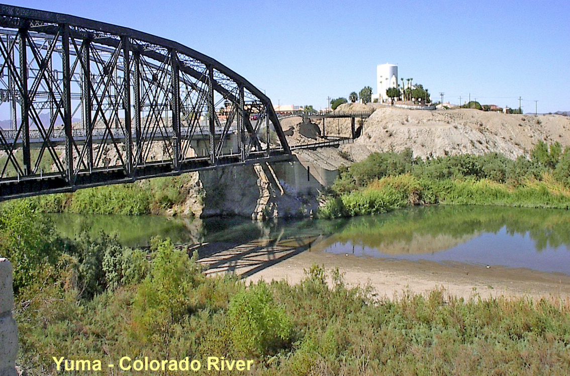
Yuma - Colorado River