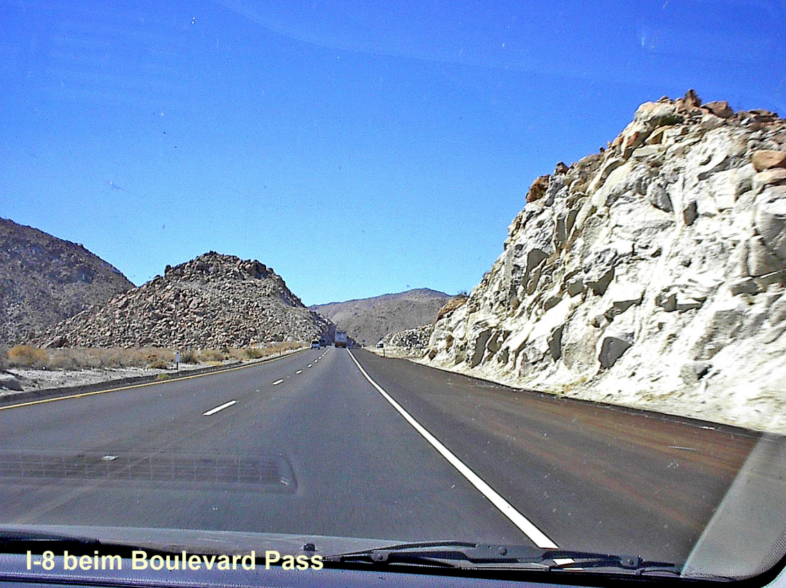
I-8 beim Boulevard Pass