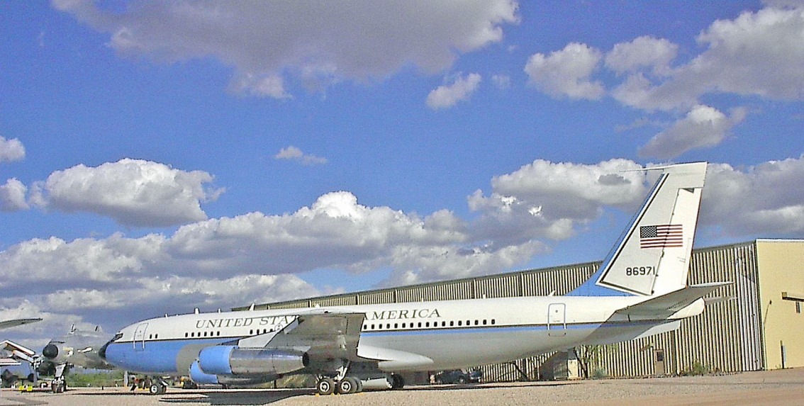
Airforce 1 für die Präsidenten Kennedy und Johnson