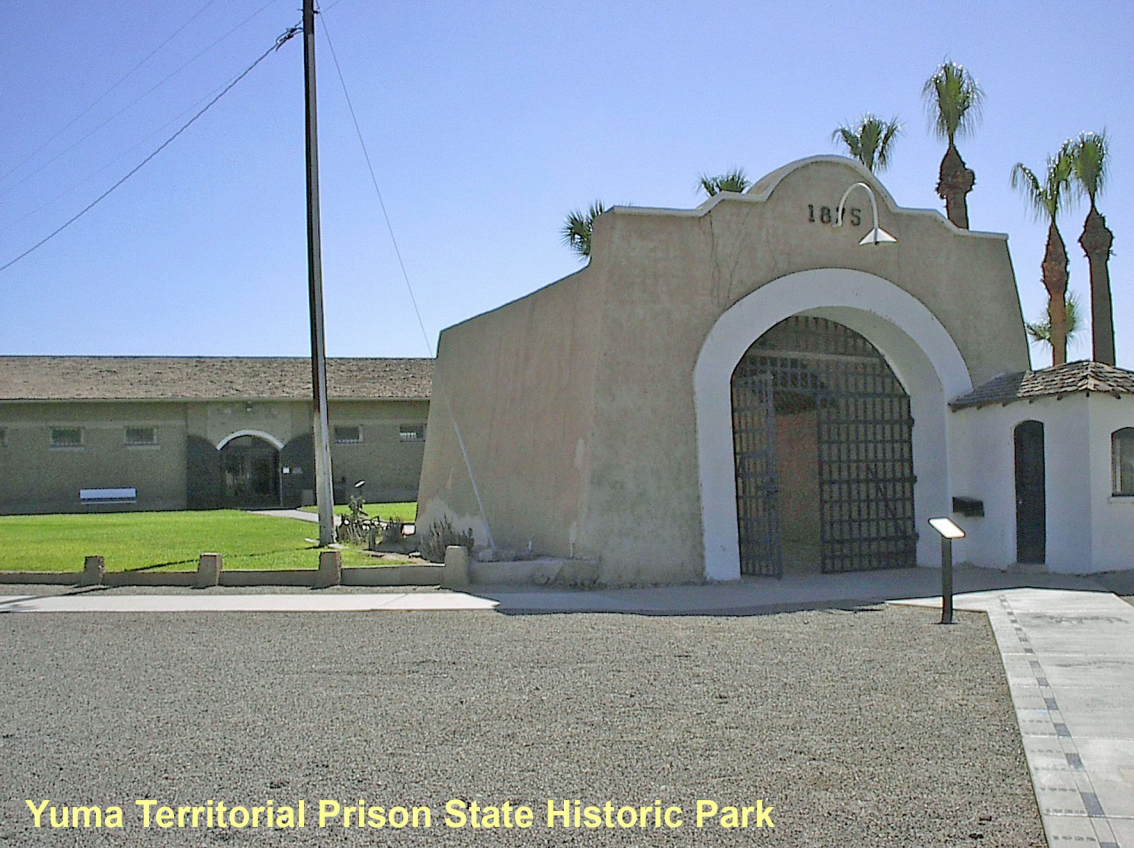
Yuma Territorial Prison State Historic Park