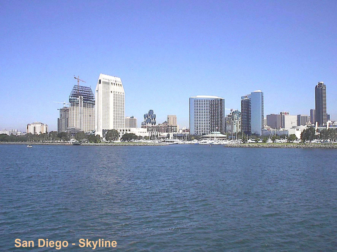
San Diego - Skyline