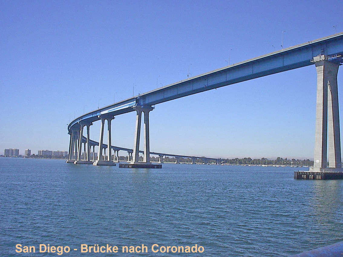
San Diego - Brücke nach Coronado