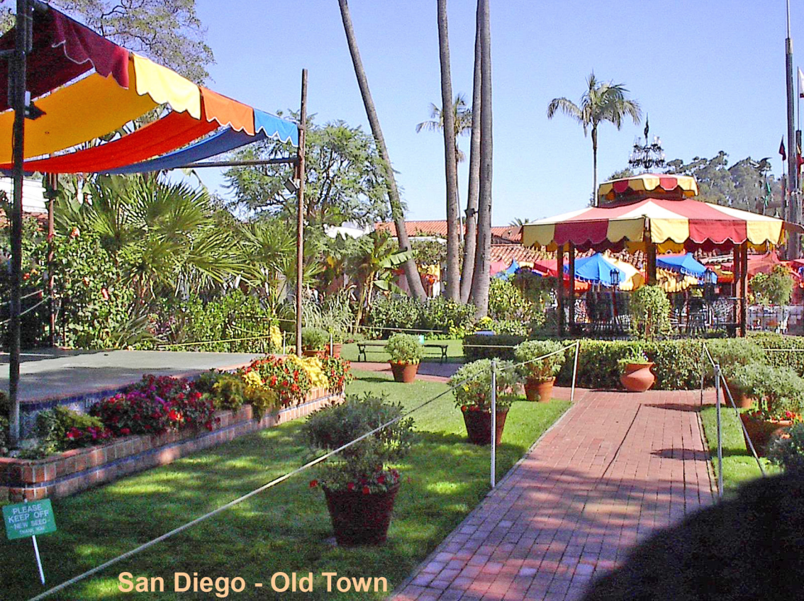
San Diego - Old Town