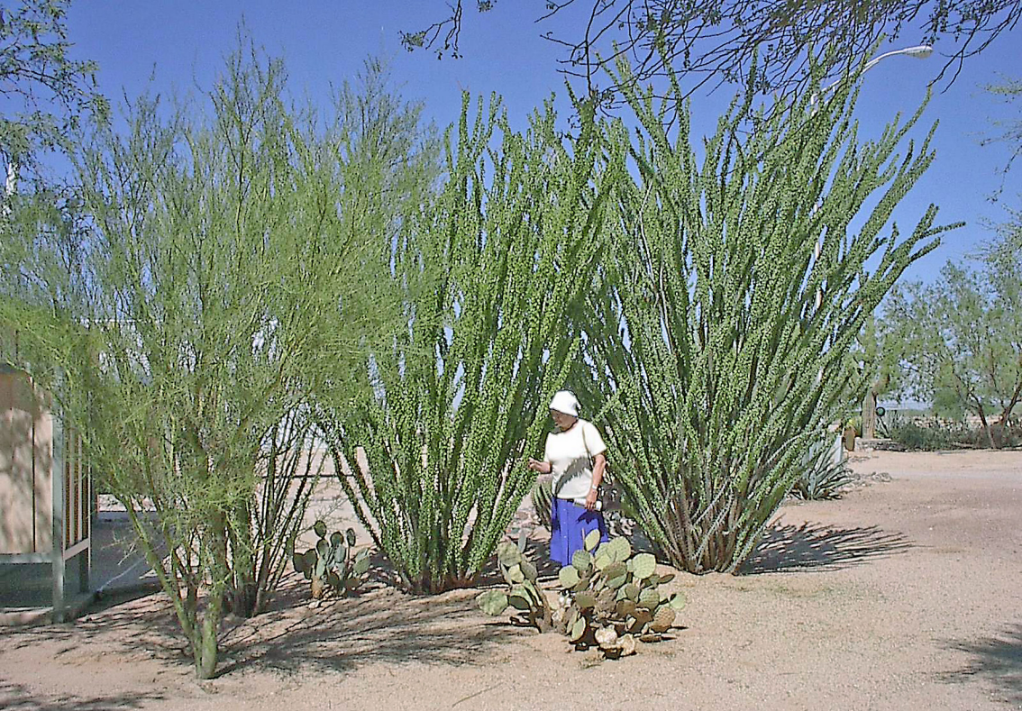
Pima Air and Space Museum