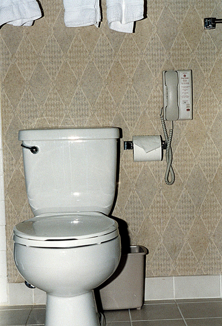
Santa Monica: Four Points Sheraton Hotel