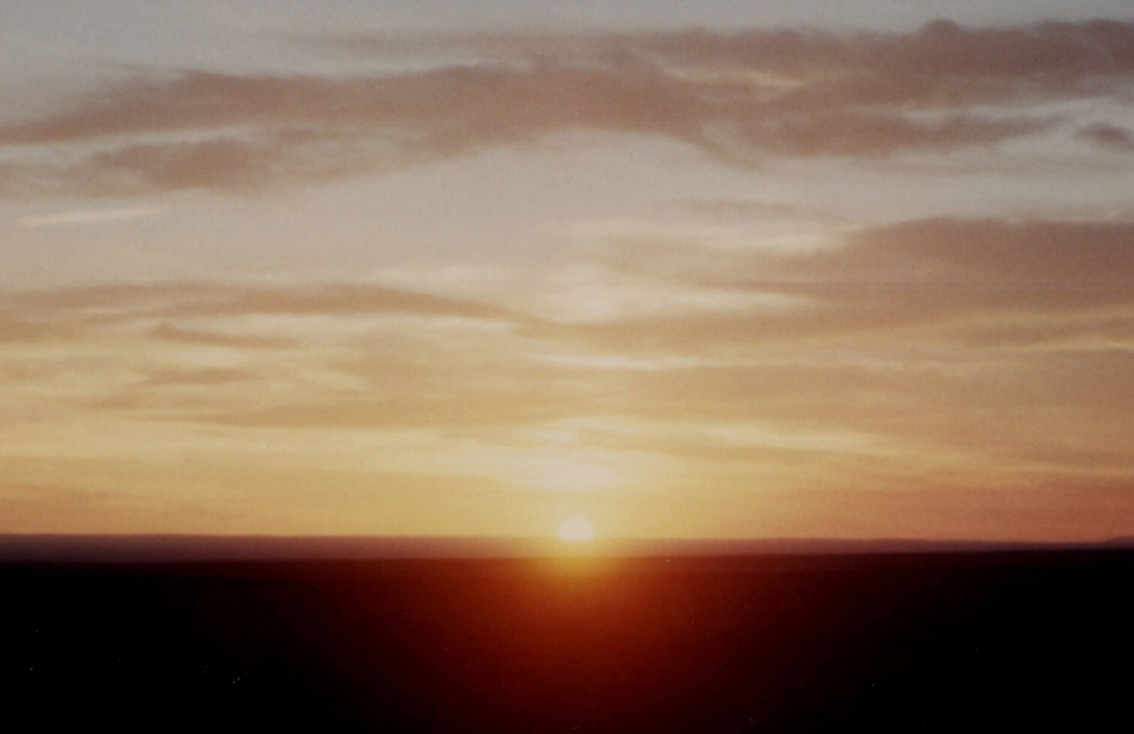
am West Rim des Grand Canyons