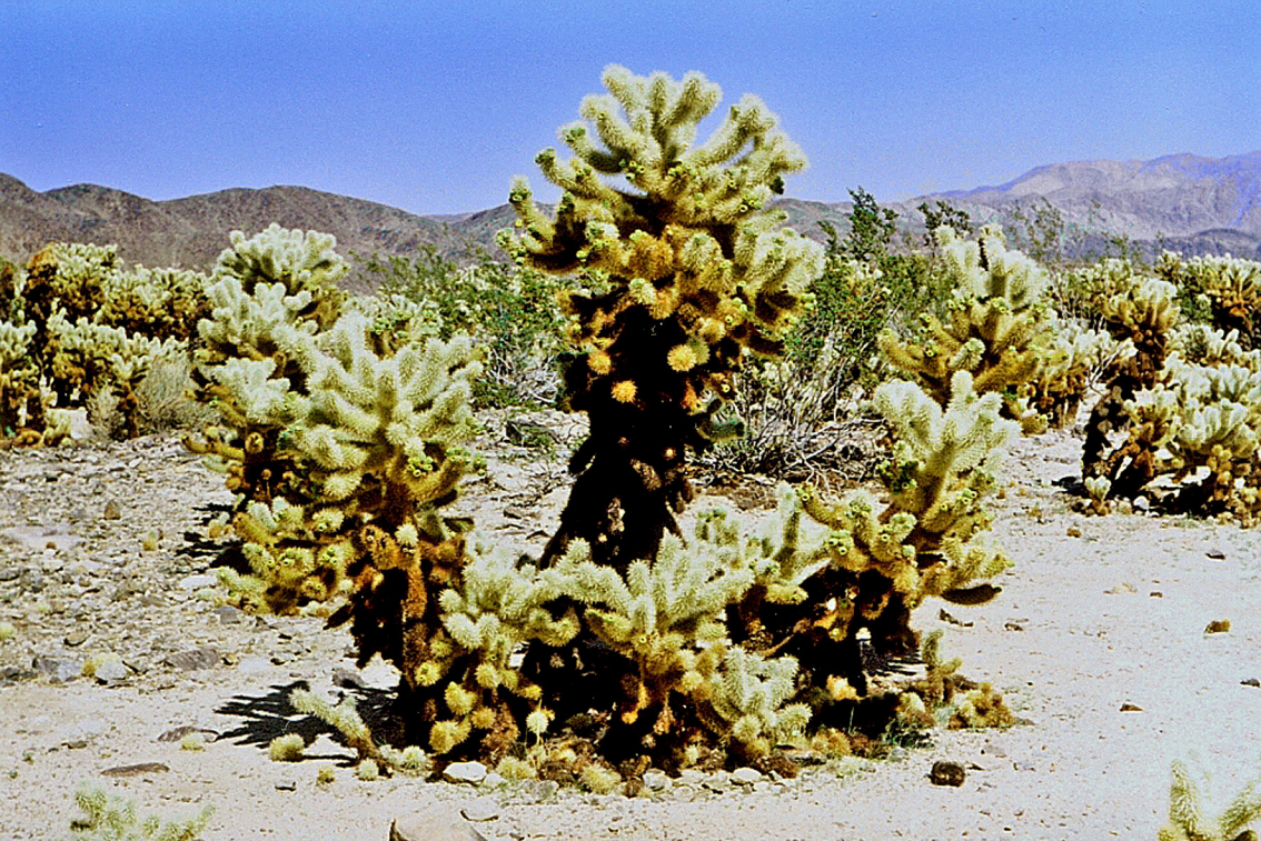
Yoshua Tree National Park - Teddybären Kakteen