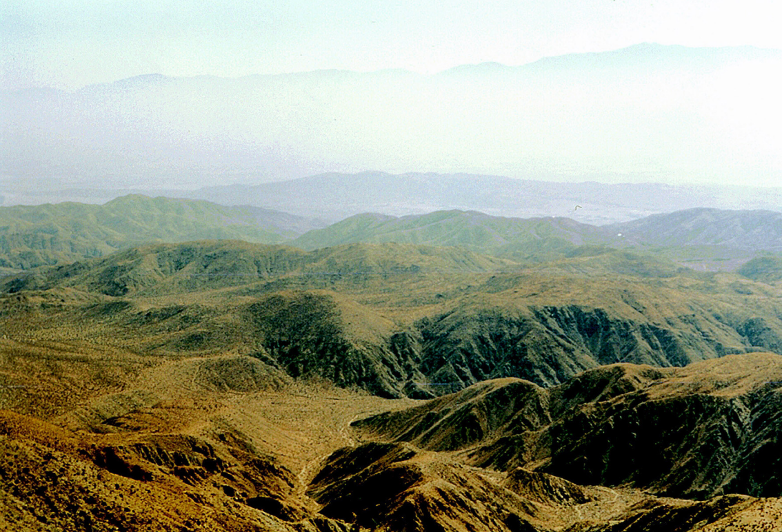
Yoshua Tree National Park - Blick vom Key-View-Point zu Palm Springs