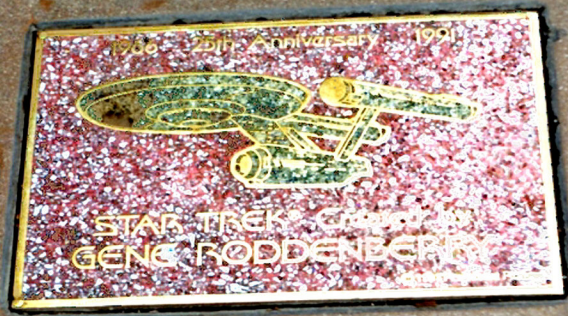
Los Angeles - Hollywood Blvd.