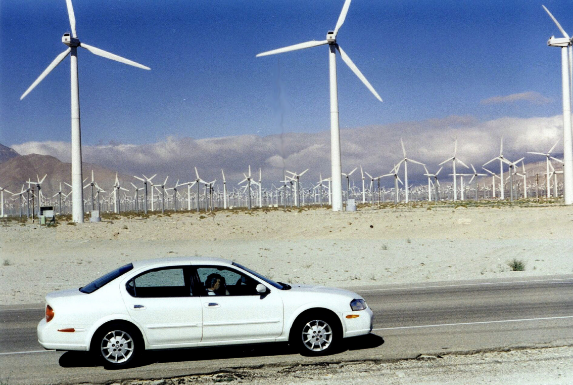
am Twentynine Palms Highway, der R-62