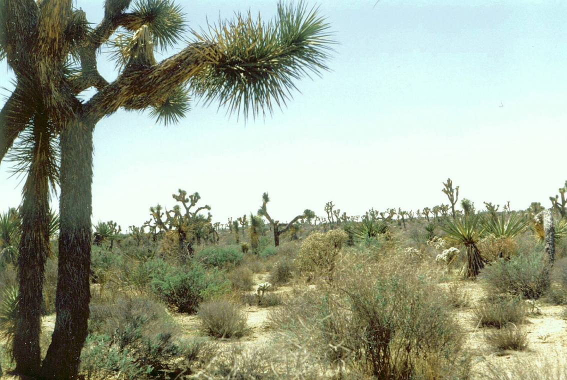
Yoshua Tree National Park