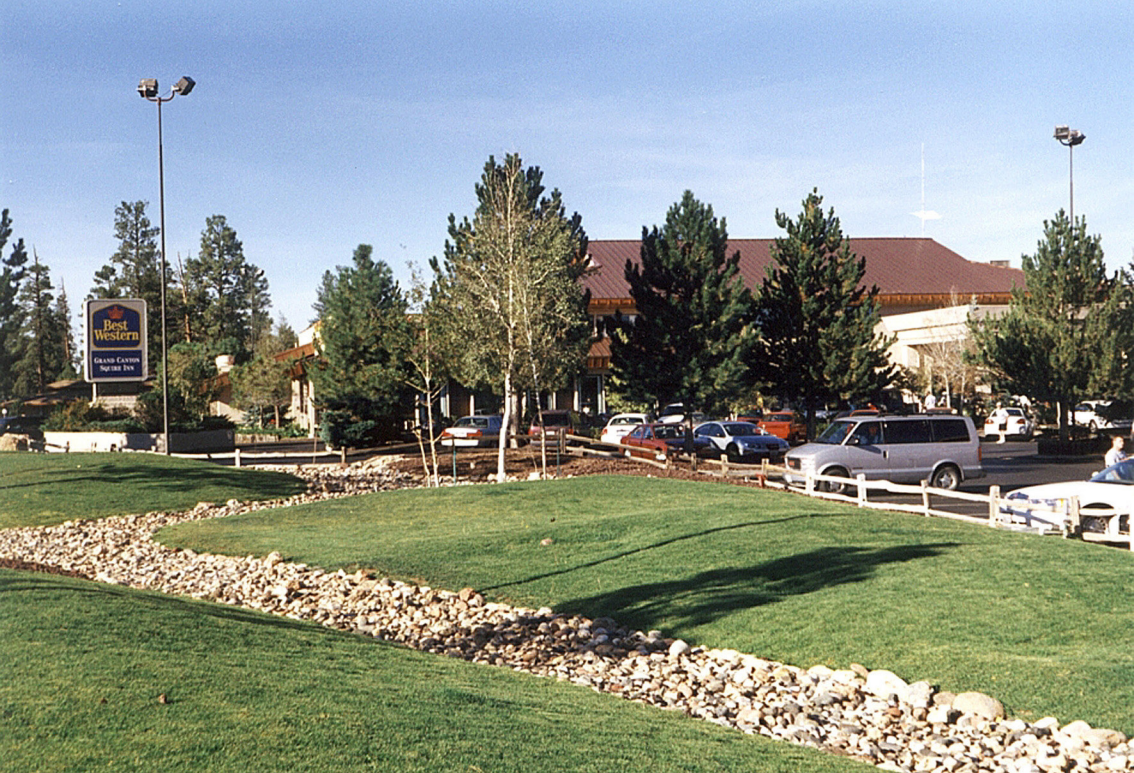
Best Western Hotel in Tusayan am Grand Canyon