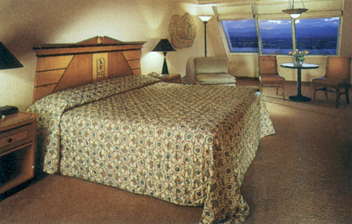
Las Vegas, Hotel Luxor