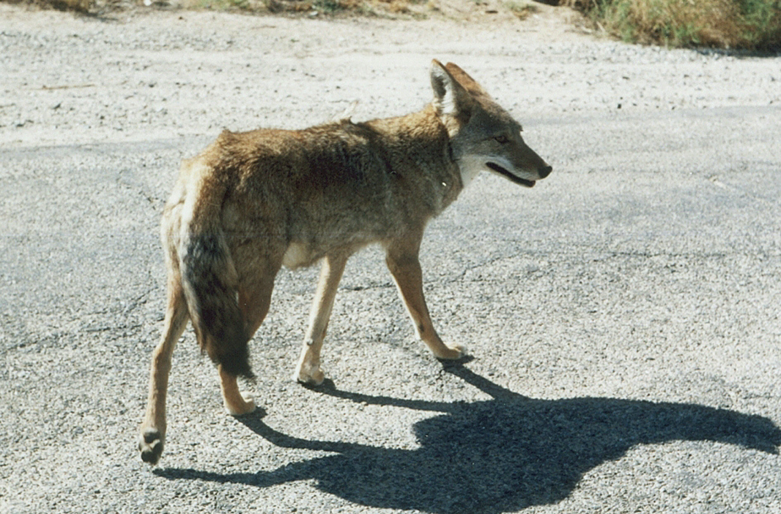
im Joshua Tree National Park