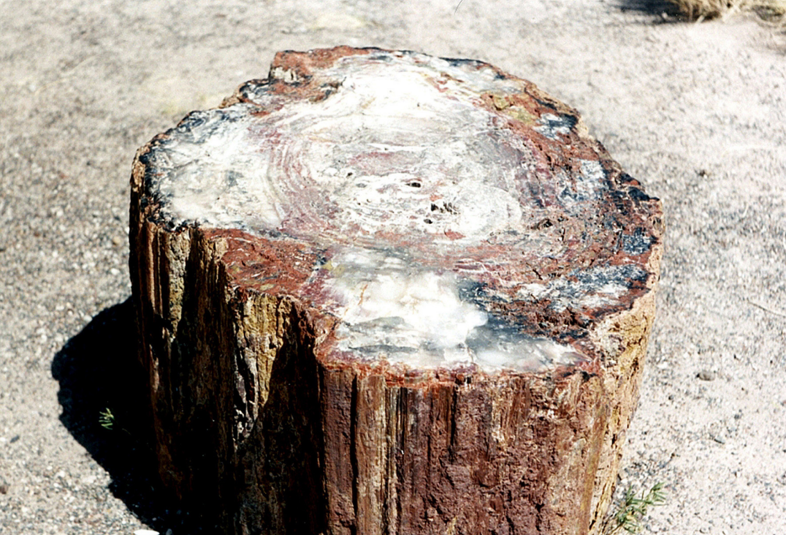
im Crystal Forest