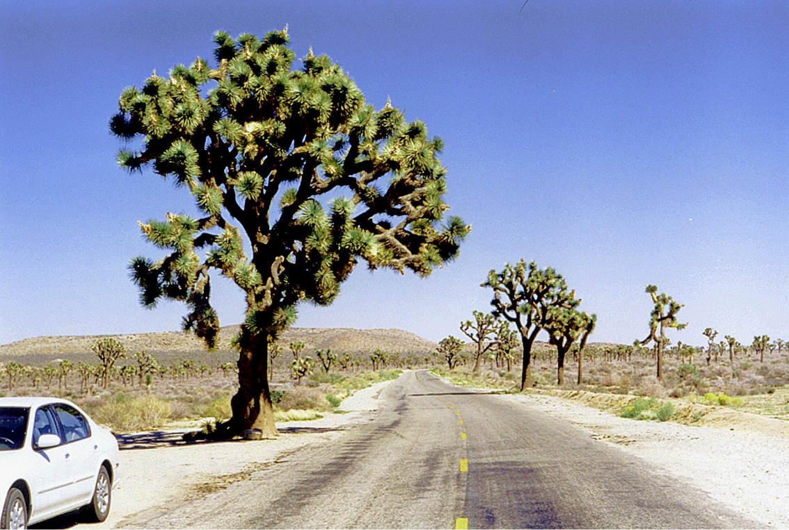
Yoshua Tree National Park