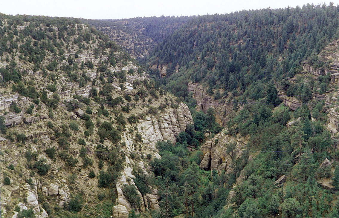
Walnut Canyon westlich von Winona