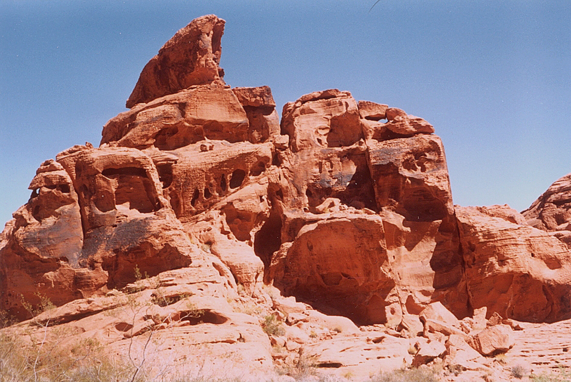
Valley of Fire