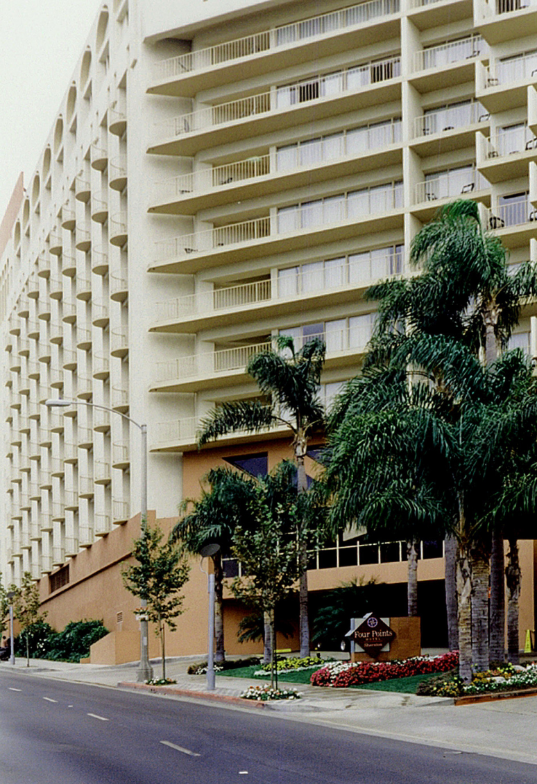
Santa Monica: Four Points Sheraton Hotel