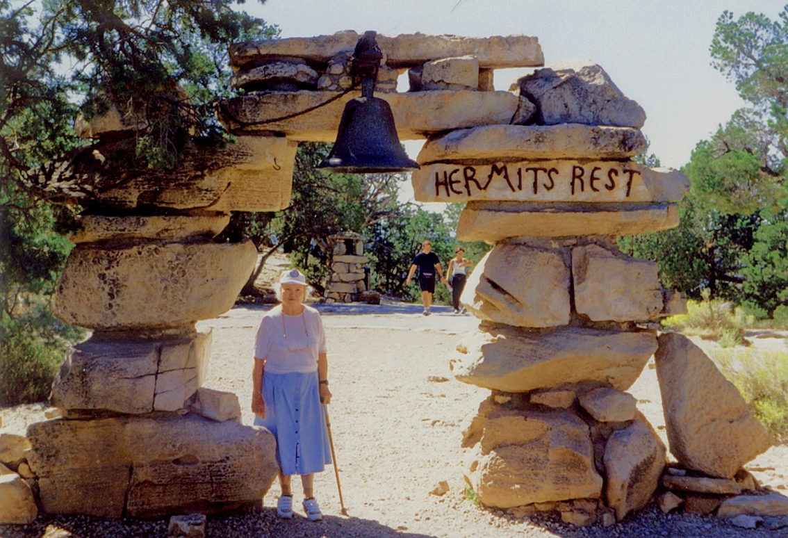
Grand Canyon, West Rim