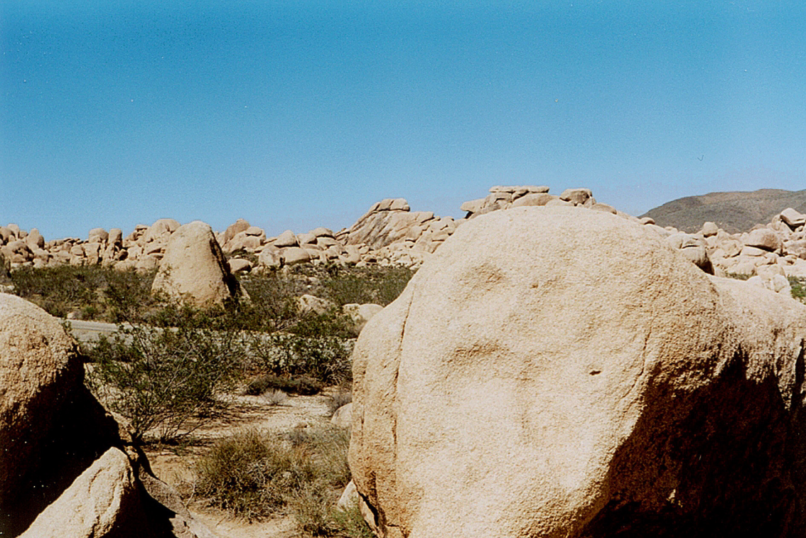
zwischen Morave- und der California-Wüste