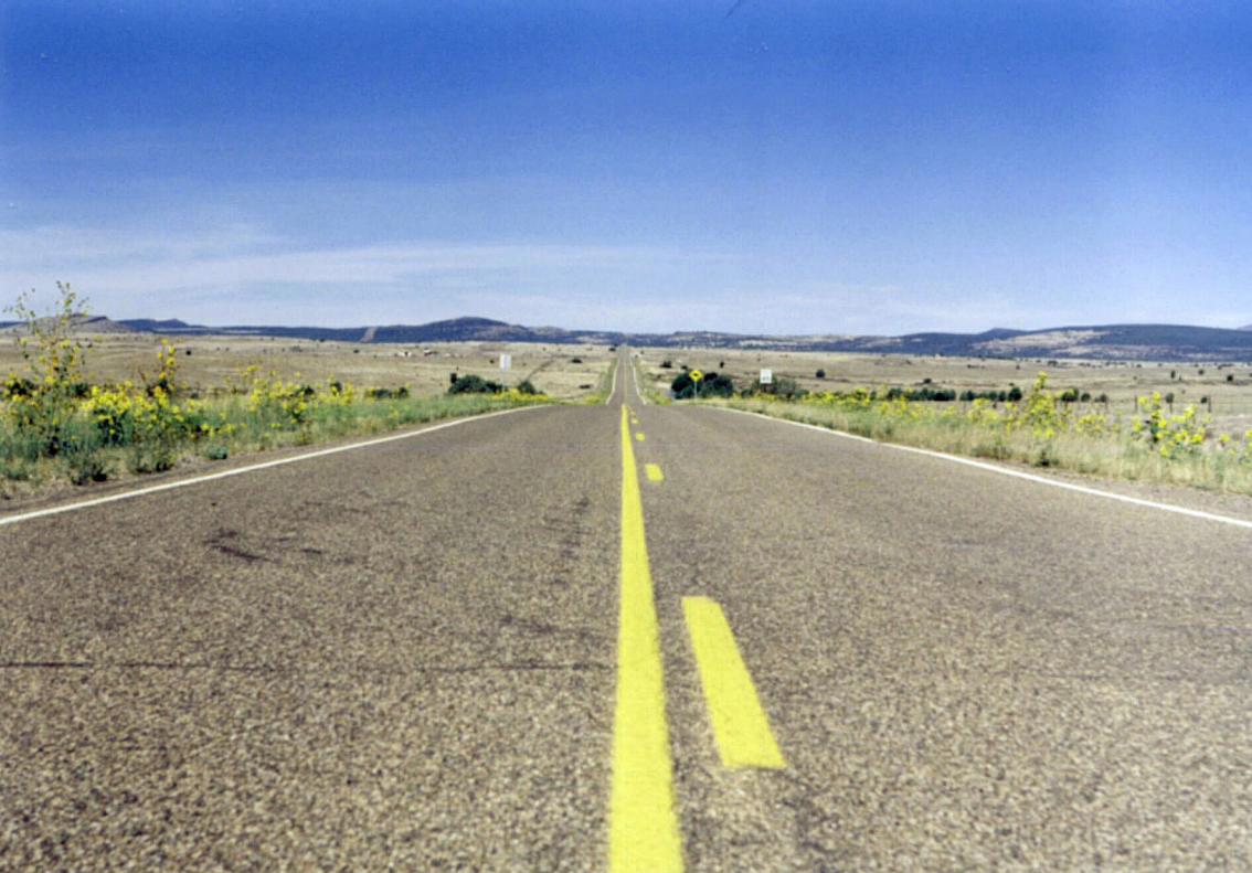
Route 66 zwischen Ashfork und Seligman