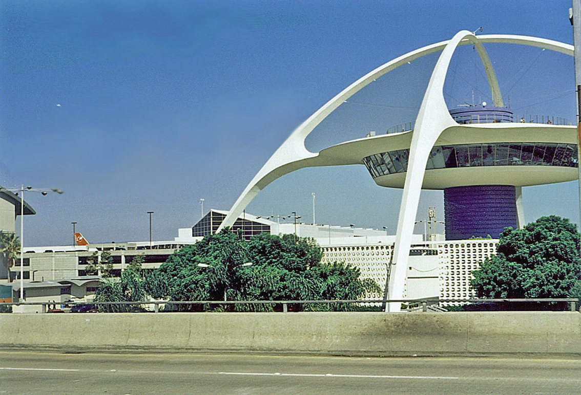
Los Angeles - Flughafen