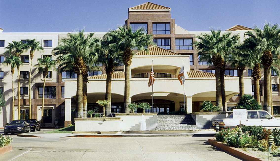
Palm Springs - Wyndham Resort