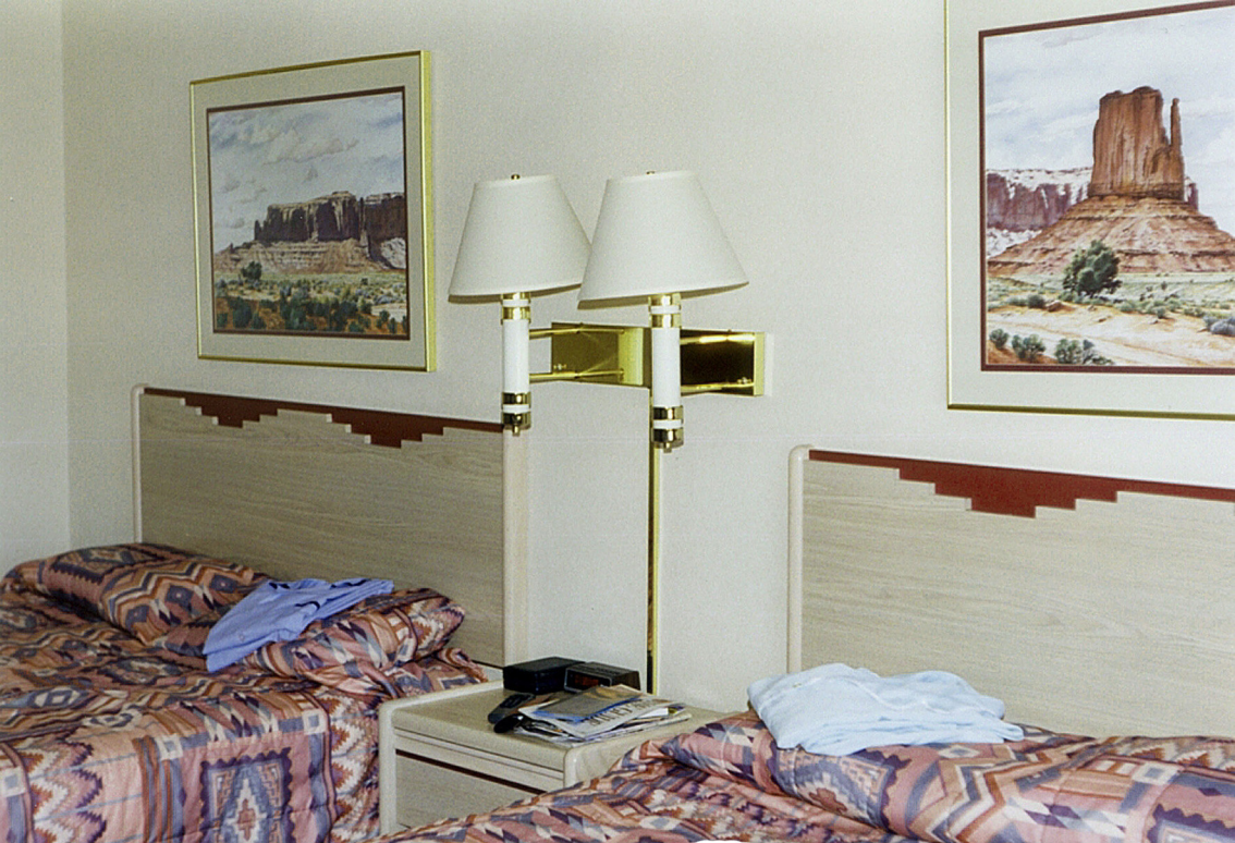
Zimmer im Best Western Hotel in Tusayan