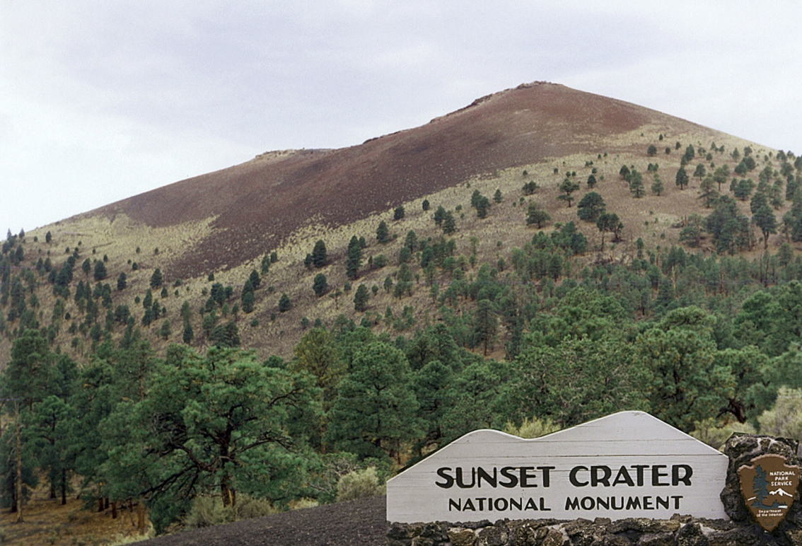
Sunset Crater Vulcano und Wupatki Nationalpark