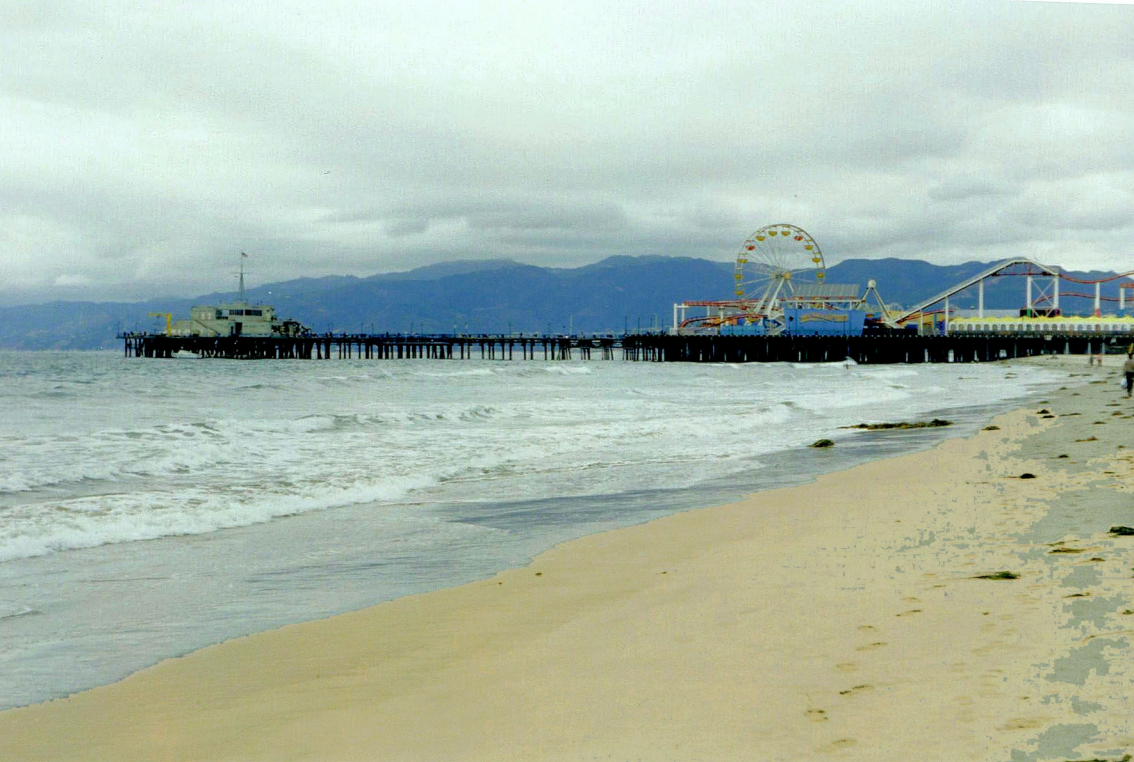
Santa Monica Pier