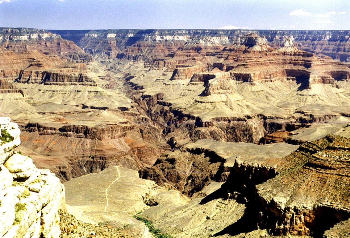
Grand Canyon, West Rim