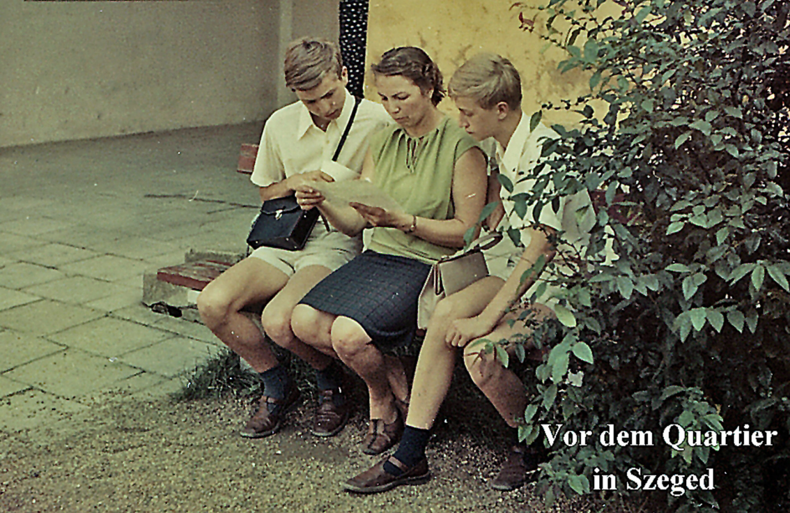
Vor dem Quartier in Szeged