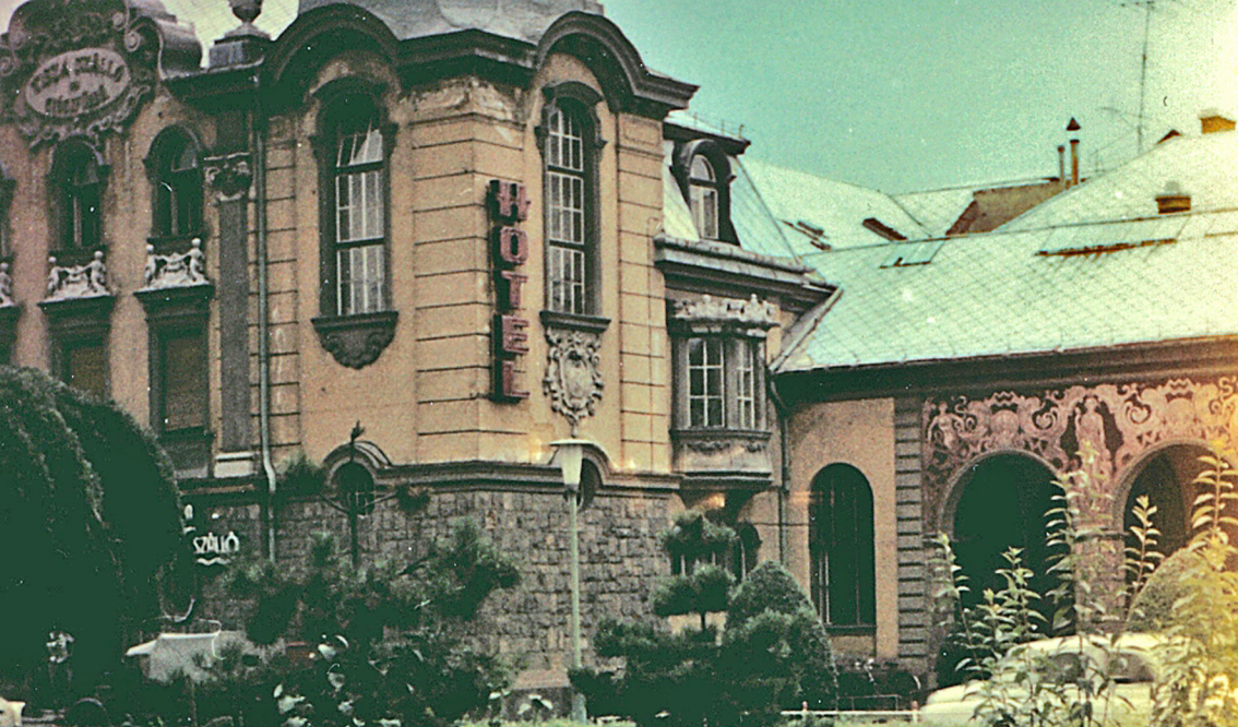
Szolnok - Hotel an der Tisza