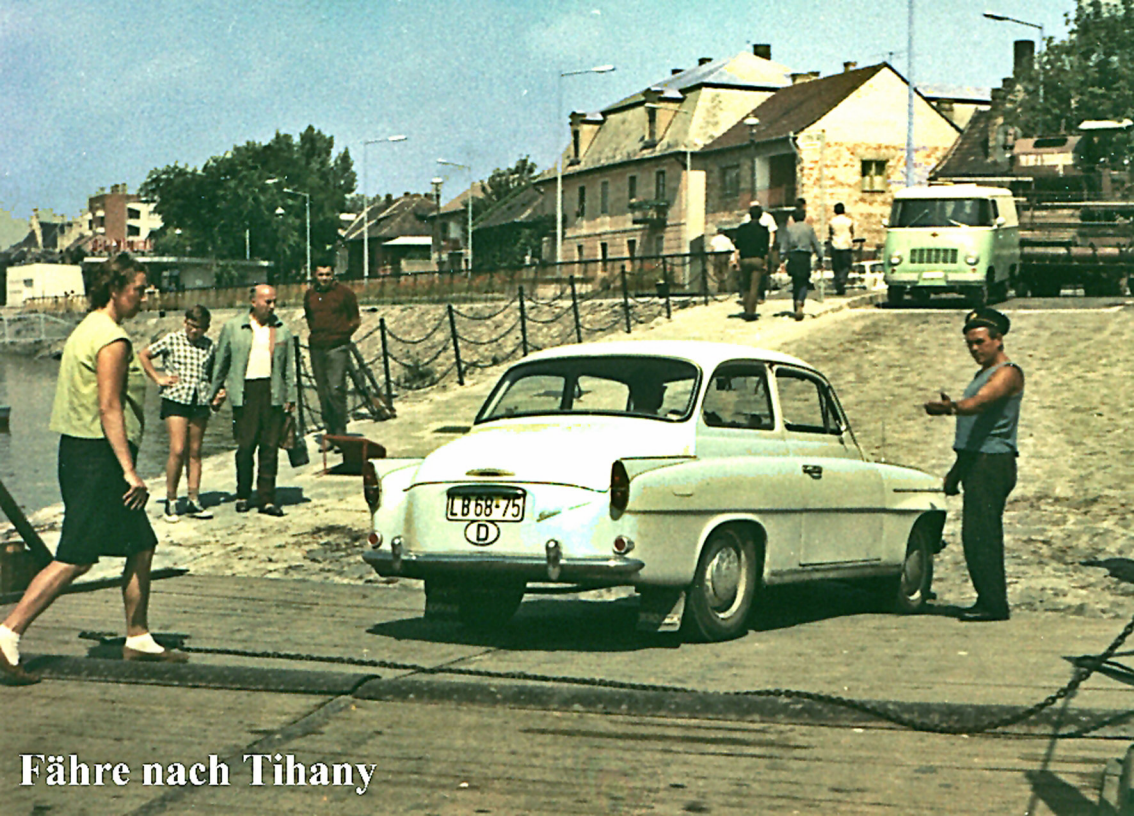
Fähre nach Tihany